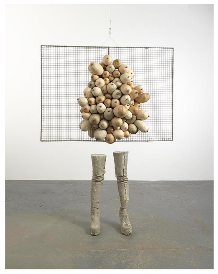
Nice Tits, 2011

Responding to the architecture of the Whitechapel Gallery, Sarah Lucas has created an installation which reconsiders the affinities and dialogues between earlier works and new sculptures. The exhibition explores the range of her work, from sculptures which assemble found objects to recent works in concrete, plaster and bronze, using the techniques of casting and construction. The show expands on Lucas' year-long project SITUATION in which she constructed a series of sculptural installations in a space above Sadie Coles HQ in London.