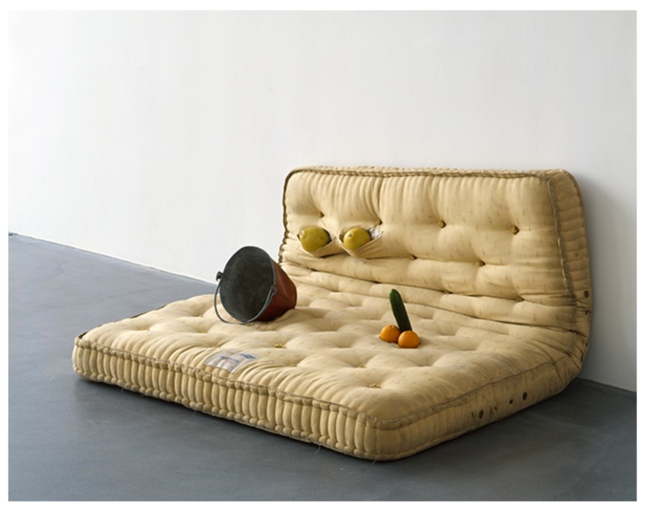
Au Naturel, 1994

"Sarah Lucas, "SITUATION Absolute Beach Man Rubble" at Whitechapel Gallery, London," Mousse , October 17, 2013.