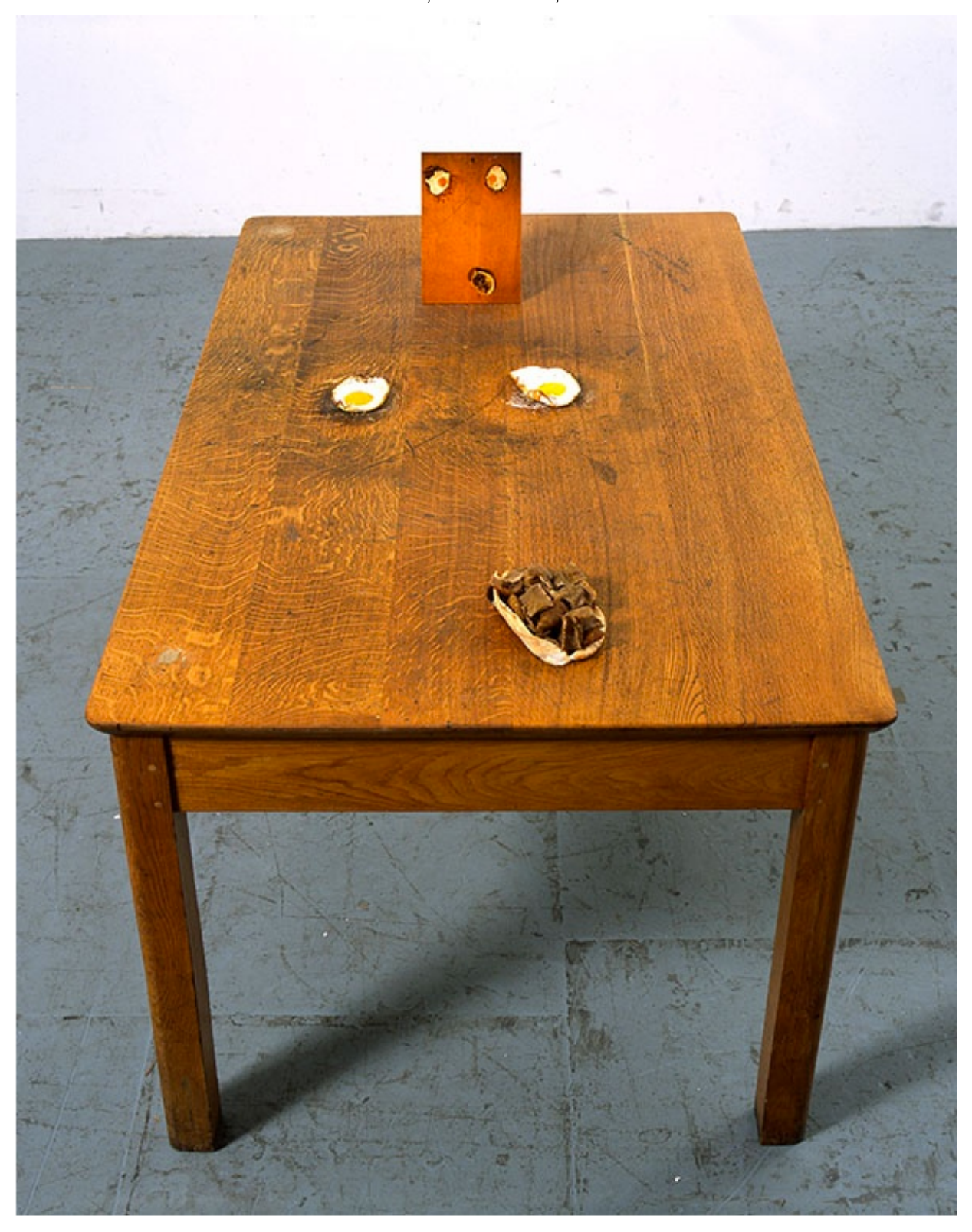
Two Fried Eggs and a Kebab, 1992

"Sarah Lucas, "SITUATION Absolute Beach Man Rubble" at Whitechapel Gallery, London," Mousse , October 17, 2013.