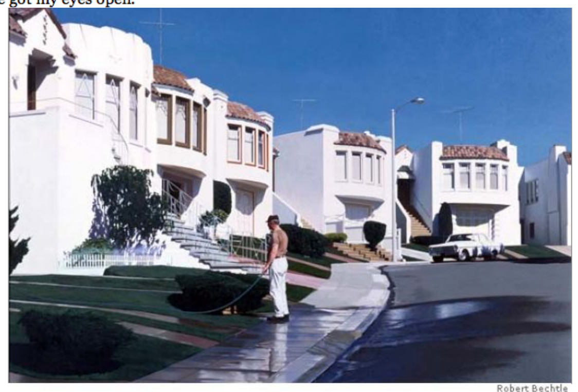
Frisco Nova, 1979 Collection of the City and County of San Francisco; Purchased by the San Francisco Arts Commission for the San Francisco International Airport

The area around 20th and Arkansas streets has inspired numerous drawings and paintings, from various vantage points at different times of day. Bechtle walks around there most every day. Sometimes nothing grabs him. "But I'm paying attention," he says. "I've got my eyes open."