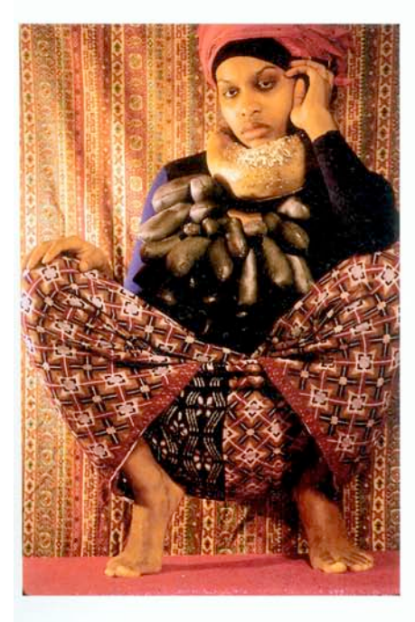
WANGECHI MUTU, UNTITLED, 1997 (FROM THE ETHNOGRAPHIC JEWELRY SERIES), mixed media performance / OHNE TITEL (AUS DER SERIE ZU ETHNOGRAPHISCHEM SCHMUCK), Performance, verschiedene Medien.

This work, in many ways, encapsulates the visual progression and socio-political content of Mutu's art. Among her many aesthetic and conceptual concerns, she has focused on re-imagining the world, the transformative and transgressive power of the female