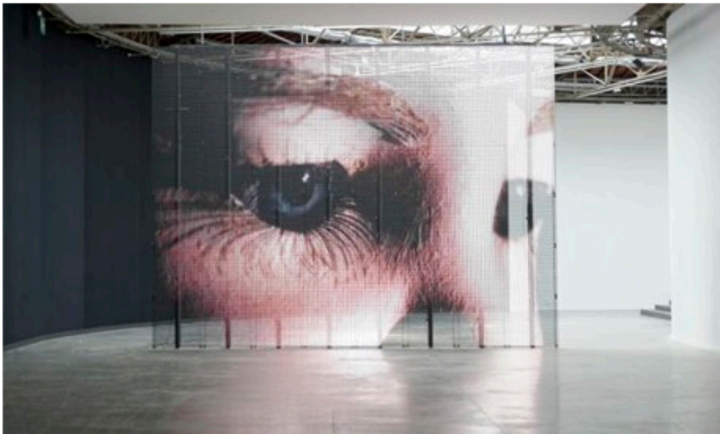
Watching you baby... Philippe Parreno's Anywhere, Anywhere Out of the World.