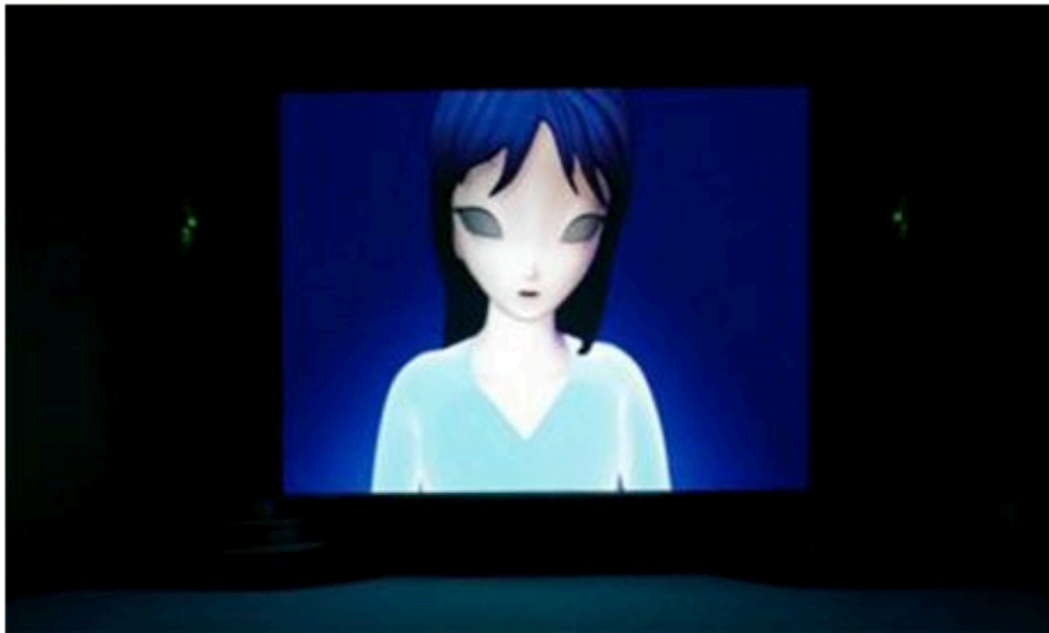
Annlee, created by Parreno and Pierre Huyghe.

There are so many details to catch on. Even the end wall of one space, covered in black material, vibrates with a sonorous hum. And what of the bookcase, for which Dominique Gonzalez-Foerster acted as librarian, that pivots to allow access to a secret room containing a recreation of a John Cage and Merce Cunningham show, in which the pair substitute one another's work over the show's duration, swapping Cage's spidery, trembling drawings with Cunningham's lovely drawings of owls, cormorants and herons. This inclusion is like a love story.