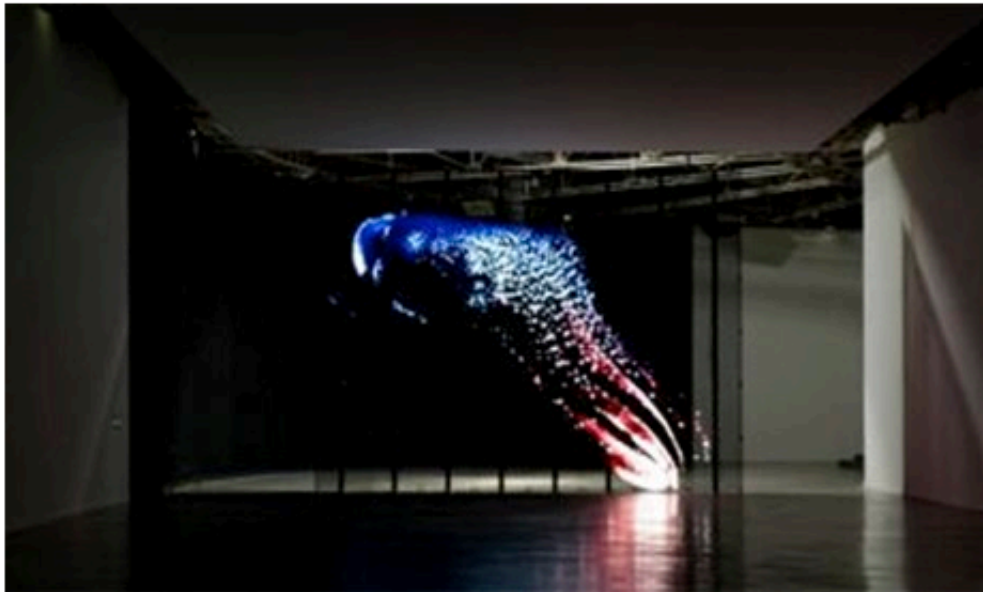
'He never forgets his audience.'

Often, big surveys of an artist's work can become one damn thing after another, and they exhaust you. Parreno, who earlier this year created the mise en scène for the Barbican's exhibition The Bride and the Bachelors: Duchamp with Cage, Cunningham, Rauschenberg and Johns , never differentiates between his works and their setting. He never forgets his audience, and how his spectators move from work to work. He knows we bring his works to life, asking in return to be surprised, enchanted and taken on a journey. All his works are a collaboration: with the setting, with us, and with the many other artists he has worked with, both living and dead.