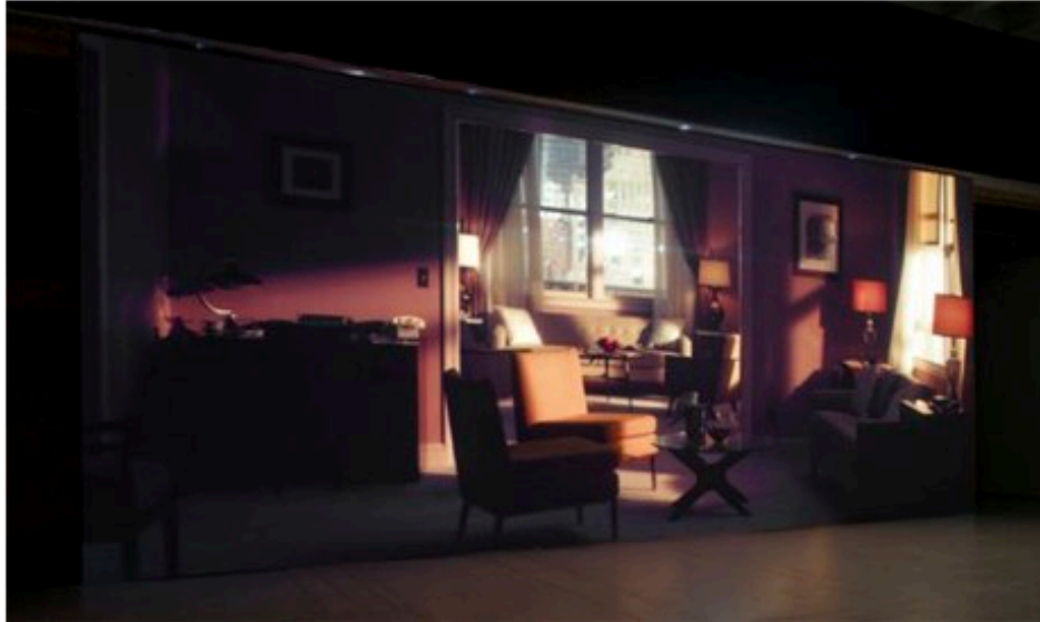
Parreno's version of Marilyn Monroe's suite at the Waldorf Astoria.

Why the tears? My own moment came when watching Parreno's 2012 film Marilyn . Monroe's voice, recreated by computer, takes us on a tour of the hotel suite where she lived in the late 1950s. What Marilyn sees, the camera sees. We watch through her eyes. Sunlight falls into the room. Rain beats at the window. Sometimes the camera swerves along with Marilyn's frantic glances, her growing sense of hysteria and entrapment. Her eyes snag on the corners of things, the light glancing cruelly on polished surfaces. The studied normality of the room becomes a prison. The cushions, too perfectly arranged at either end of a sofa, look like a dumb rebuke. Her solitude seems terrible. The telephone rings but goes unanswered.