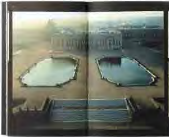
1 Photograph of the Palace of Versailles in Horst Bredekamp, Leibniz, Herrenhausen and Versailles: The French Garden, a Modern Way , 2013