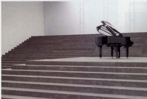
From left: Liam Gillick, Factories in the Snow , 2007. Disklavier piano, artificial black snow. Installation view. "View of Philippe Parreno: Anywhere, Anywhere, Out of the World ," 2013. Scores: 56 Flickering Lights (detail), 2013. Windows: Out of Focus Windows (detail), 2013. Philippe Parreno, Fade to Black , 2013, phosphorescent ink and silk screen on paper. Installation view.

La Bibliothèque clandestine , 2013 (Nabokov, Salinger, Bret Easton Ellis, Lovecraft, Verne, etc.). Through this Hitchcockian portal, viewers enter a remake of a show Parreno saw in 2002 at New York's Margarete Roeder Gallery, featuring elegant framed drawings by John Cage and Merce Cunningham. At the Palais de Tokyo, as in the original show, the drawings are reinstalled in different permutations each day. In a darkened room one floor down hang eighteen big, boxy illuminated movie marquees that turn on and off to the score, and from a white platform in the next gallery comes the sound of foot