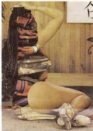
FROM TOP: Wangechi Mutu, Riding Death in My Sleep, 2001. Ink and collage on paper, 60 X 44 in. The Ark Collection, 2006. 9 1/2 x 6 1/2 in.

and calibrated to drip dark red slowly onto surfaces and floors. In The Master's Imaginary Dual Is Over (2006), an outdoor installation for Ballroom Marfa, the bottles hung amid spindly asymmetric crucifixes and shallow metal fonts for the pooling liquid. Like grass-lush tribalism or iconographic flatness, this bare, open-air Catholicism is yet another environment colonized by Mutu.