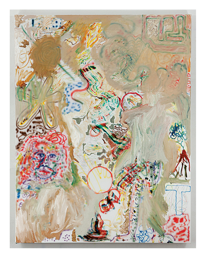
Shrimp, 70 × 54 inches, airbrush, colored pencil, and oil on canvas, 2011.

One of the coolest things in the painting is how the spectral prismatic refraction of light on the surface of the disc is portrayed (as most of the painting is) with a concise, casual exactitude. There is a conflation at work here that is both comedic and profound: the natural, dirty, archaic world butted right up against the harsh, brittle, plastic world of the digital. The primitive meeting the virtual, the world of gravity absorbed into the world of the weightless photon. The first man meeting the latest device.