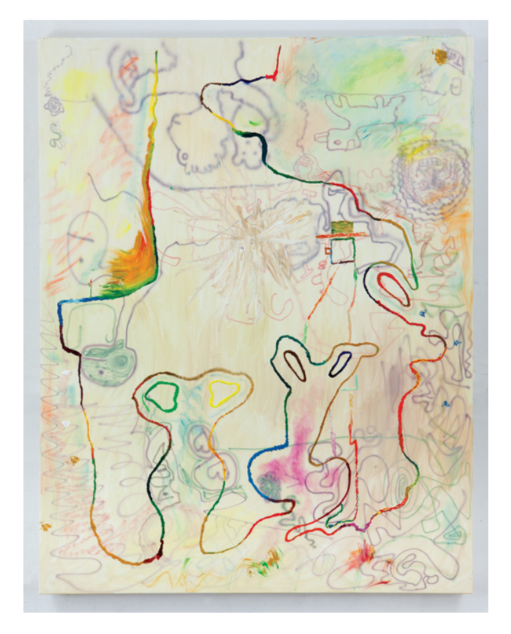
The Man Who Sees Everything, 2011, airbrush and oil on canvas, 69 × 54 inches.