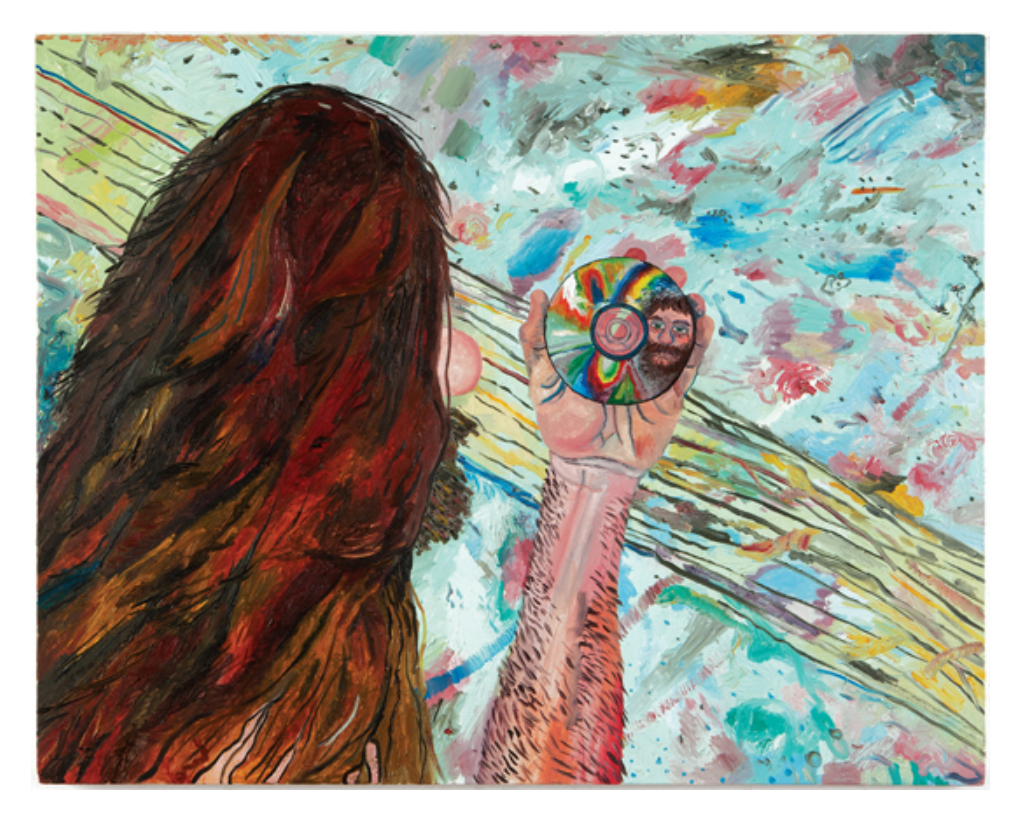
Hippie, 2007, oil on canvas, 24 × 30 inches.