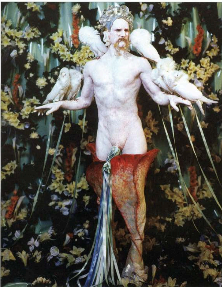
CLOCKWISE FROM TOP LEFT Matthew Barney aboard the Japanese whaling ship Nisshin Maru , in a production still from his film Drawing Restraint 9 , 2005. Barney and Björk star as the Occidental Guests in the movie's climactic love scene. The artist as a tap-dancing satyr in the feature-length film Cremaster 4 , 1994. Barney playing the Giant in Cremaster 5 , 1997.