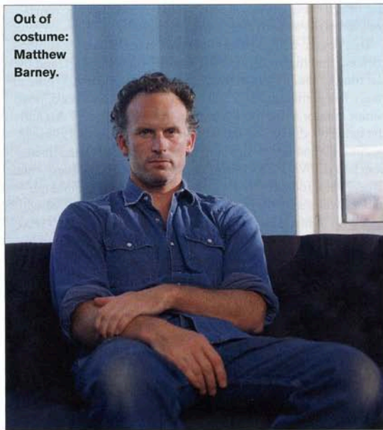
Out of costume: Matthew Barney.