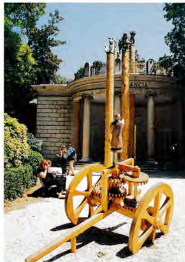
2. One Man, Nine Animals , 1999, Huang Yong Ping, wood and aluminium, 23 x 17 x 8cm. Installation view: 48th Venice Biennale, French Pavilion, 1999

It is, you're absolutely right. How are we to understand the idea of making the artwork? We shouldn't be burdened by art, but unburdened by it. In other words: if you have a feeling for art, I give you art;