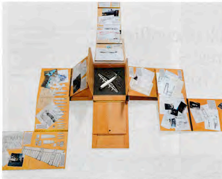
1. Image of Memorandum, Bat Project I-III , 2004, by Huang Yong Ping (b. 1954), acquired by the Ludwig Museum on the occasion of the Wolfgang Hahn Prize

The slogan of Xiamen Dada [the art group Huang founded with contemporaries in southern China in the 1980s] was 'Zen is Dada, Dada is Zen'. How are the two connected?