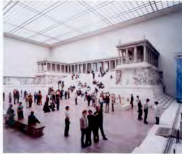
Above: Thomas Struth, Pergamon Museum I, Berlin , 2001, color photograph mounted on Plexiglas, 77 1/2 x 97 1/2".

Depending on your mood, Gaillard's show was either an open invitation to festive sociality or just another bout of public drinking in Berlin.