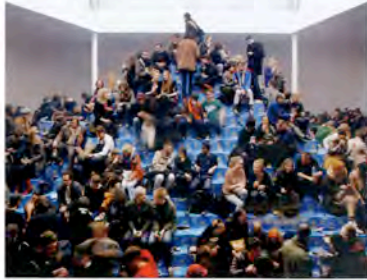
Opposite page and above: Cyprien Gaillard, The Recovery of Discovery , 2011, cardboard, glass, metal, beer. Installation views, KW Institute for Contemporary Art, Berlin.

Hal Foster, "Cyprien Gaillard: The Recovery of Discovery," Artforum , December 2011, p. 194 – 195.