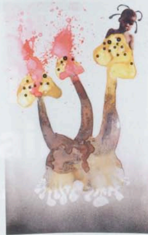
Mushwomb 6 , 2003-4, combines paint, ink, and collage.

of hunting and feral violence. Mutu's art is as beautiful as it is harrowing and displays a kind of playful, self-conscious wit.