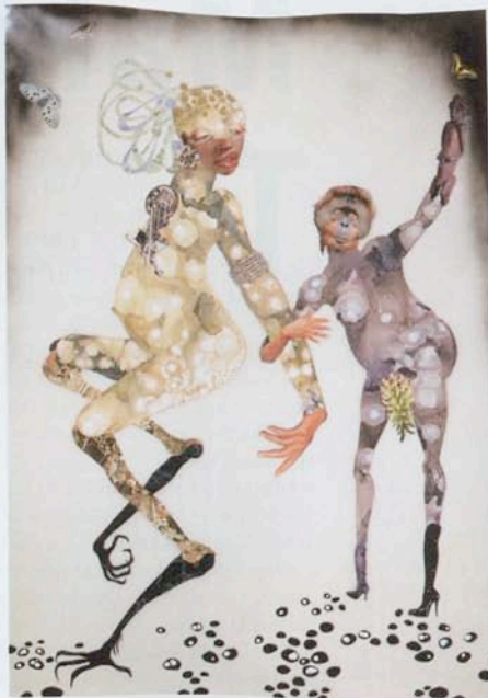
ABOVE A Passing Thought Such Frightening Ape , 2003. OPPOSITE The Bourgeois Is Banging on My Head , 2003.

Though she began as a sculptor, Mutu has since progressed to drawings, mixed-media collages, and site-specific installations. Her work examines notions of history, race, and beauty. Mutu's sources for images are wide-ranging: she uses pictures from National Geographic , outdated ethnographic books, fashion and pornography magazines, cartoons, and Victorian botanical illustrations. Assemblage figures of African women unexpectedly combine pictures of motorcycle parts and severed limbs with full lips and curled eyelashes. Glamorous, sensual images of the female body mingle with images