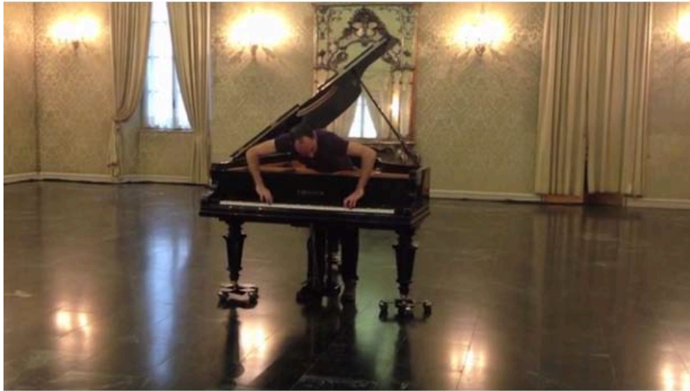
allora & calzadilla 'stop, repair, prepare: variations on 'ode to joy' for a prepared piano' video

upon entering the palazzo's sumptuous courtyard, echoing operatic voices reverberate throughout the space, initially mystifying visitors as their source is imperceivable. it becomes evident as one approaches that the choral tones are from human singers, hidden within the small tunnels and tubes of a towering foam and plaster sculpture at the court's core. 'sediments, sentiments (figures of speech)' is a live performance delivered by fourteen opera singers, who casually enact the musical compositions, occasionally peeking out from their respective voids to glance at the crowd of mesmerized viewers.