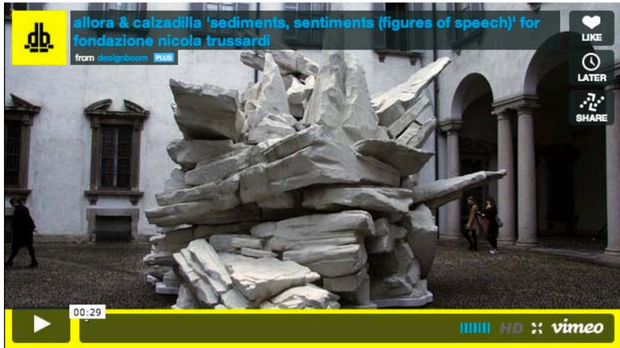
allora & calzadilla 'sediments, sentiments (figures of speech)' for fondazione nicola trussardi video