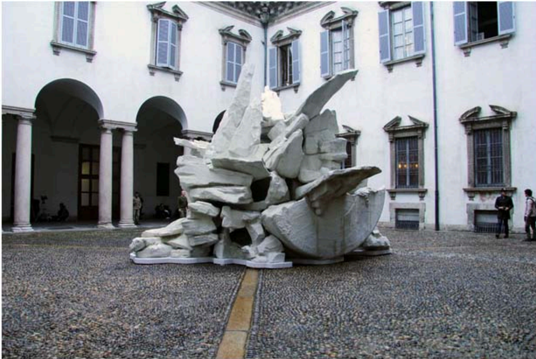
the sculptural artwork at the courtyard's core, hiding a collection of opera singers in its tunnels

Nina Azzarelo, "Allora & Calzadilla at Fondazione Nicola Trussardi," Design Boom , October 23, 2013.