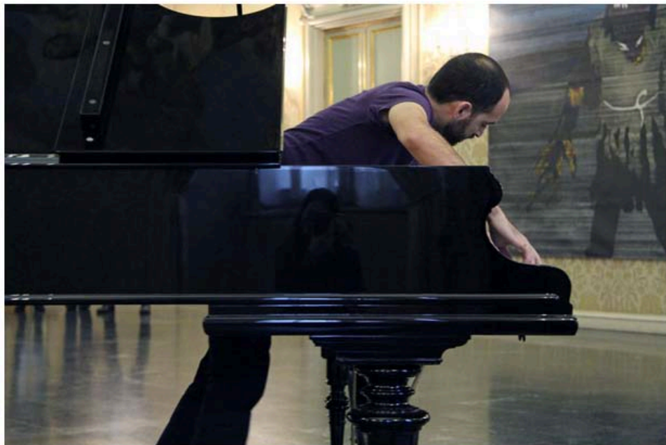
the musician leans over the piano to play, while simultaneously walking around the space

arguably one of the exhibition's most impressive installments is 'stop, repair, prepare'. allora & calzadilla have modified a grand piano by carving a circular hole directly through it. once an hour, a pianist standing within the void, behind the keyboard, angles over the keys and attempts to play variations of 'ode to joy'. performing upside down and backwards, the musician additionally mobilizes, carrying the massive instrument around his waist throughout the room.