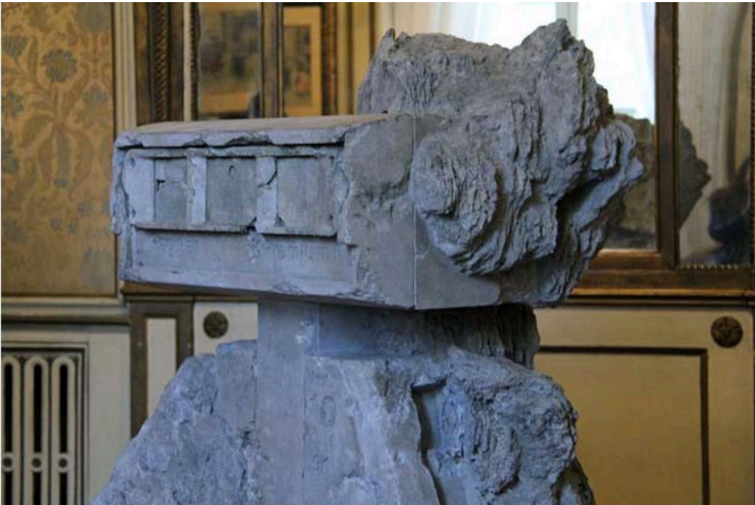
petrified petrol pump is a sculptural stone representation of a gasoline pump