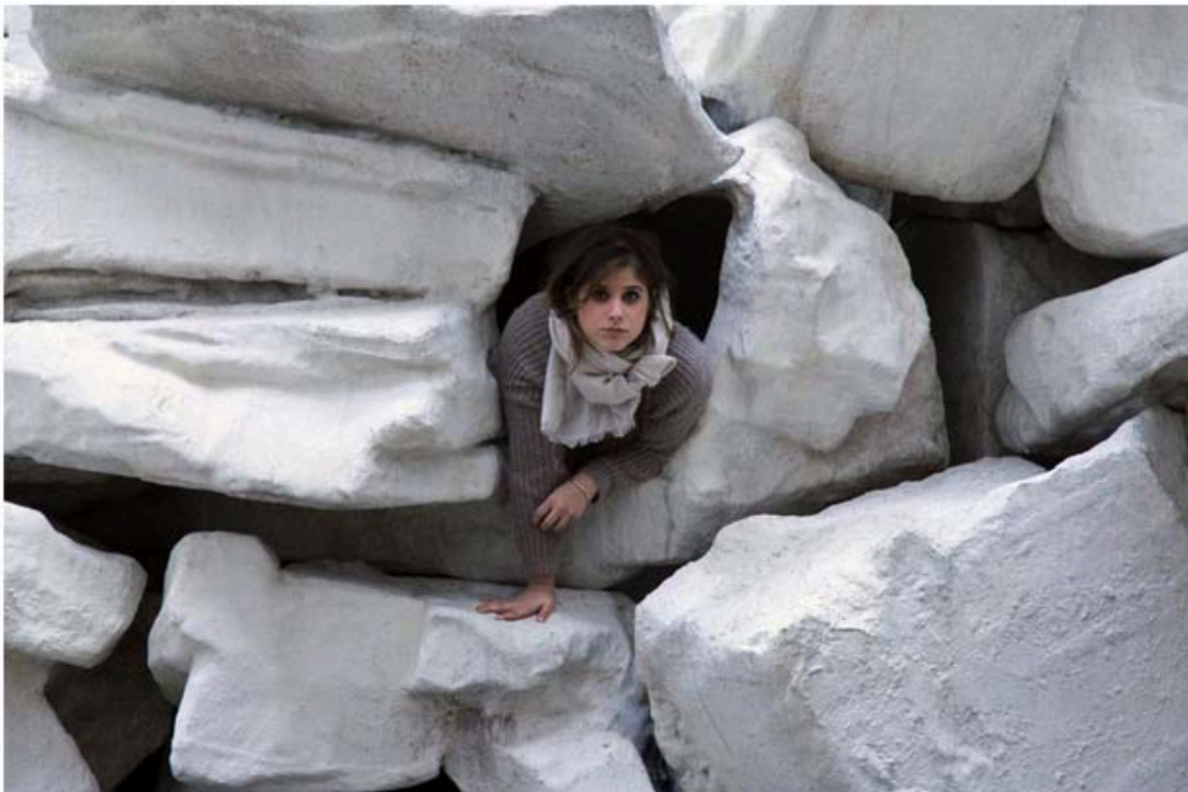
an opera singer peeks out from a tunnel within the massive sculpture image © designboom