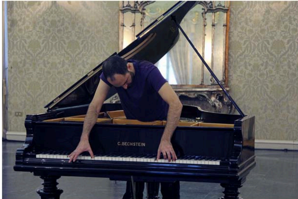
the pianist plays a musical composition while inside his instrument