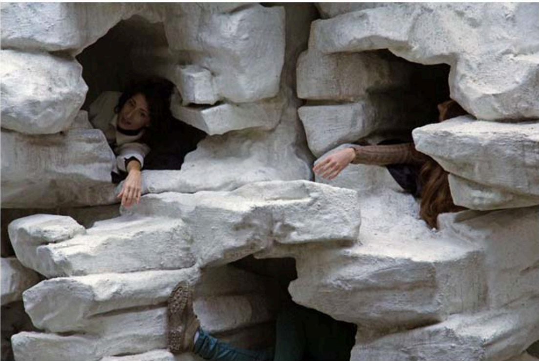
singers glancing and stretching in the sculpture image © designboom