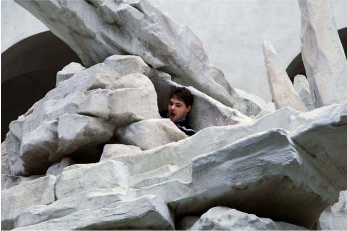
a male singer enacts the operatic composition image © designboom

Nina Azzarello, "Allora & Calzadilla at Fondazione Nicola Trussardi," Design Boom , October 23, 2013.