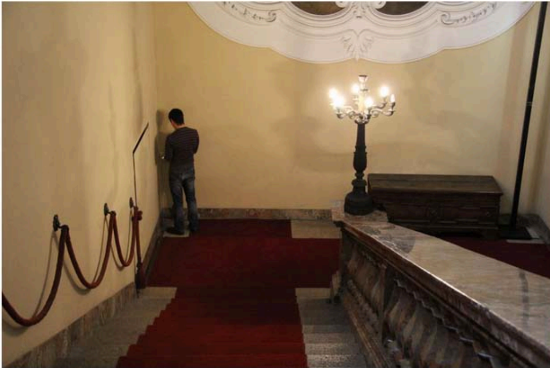
wake up (rising) features a jazz trumpeter on the grand staircase improvising different chords as he walks up and down the steps