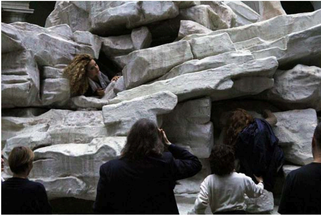
opera singers hidden inside the foam and plaster installation