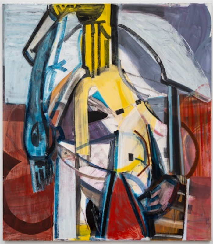
Amy Sillman, Albatross 1 , 2024. Acrylic and oil on linen, 75 x 66 inches. © Amy Sillman. Courtesy the artist and Gladstone Gallery. Photo: by David Regen.