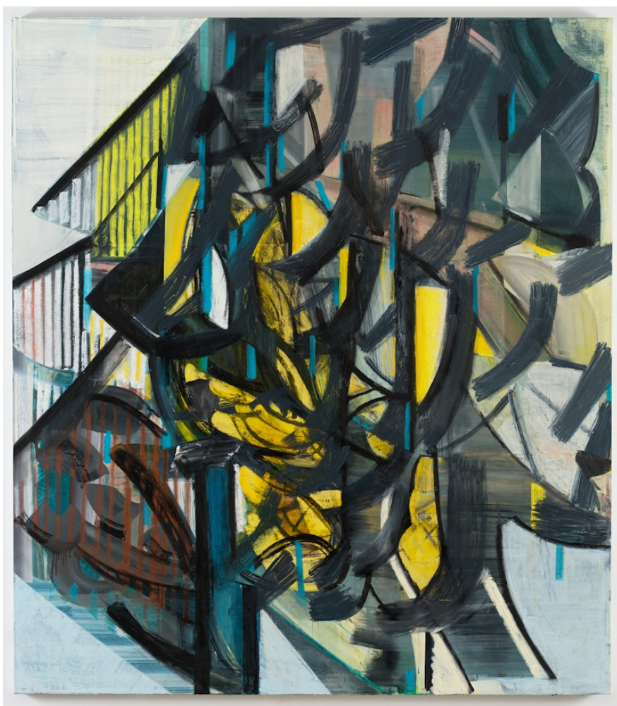
Amy Sillman, The anana Tree , 2023. Oil and acrylic on linen, 75 x 66 inches. © Amy Sillman. Courtesy the artist and Gladstone Gallery. Photo: David Regen.

I remember Sillman’s 2020 show in the same galleries, which embraced erasure as a finishing move in acrylic and ink canvases paired with studies of blooming flowers, and how the oils used halted horizontal stripes to complicate form much like the mottled interior of the tiger lily. Or her 2016 show at Sikkema Jenkins, which had paintings full of growths and appendages getting swallowed and spit out. Sillman prefers “metabolism” to “style,” and in her essay “Notes on Awkwardness” describes the former as “the intimate and discomforting process of things changing as they go awry, look uncomfortable, have to be confronted, repaired, or risked, i.e., the process of trying to figure something out while doing it.” In this kind of painting—intensely bodily rather than architectonic—every embellishment is a gauze to the layer beneath. “Finding a form is building these feelings (in this case, dissatisfaction, embarrassment, and doubt) into a substance.” Doubt may be the most elusive and useful of these emotions in building substance; unlike shame, it stifles and paralyzes, letting sediment stubbornly hold on too long. But in Sillman’s paintings, that standstill moment at the end of all the accretion has always been countered with a risk or a wager, a move that brings the composition to a definite resting state, however uneasy or awkward it may look.