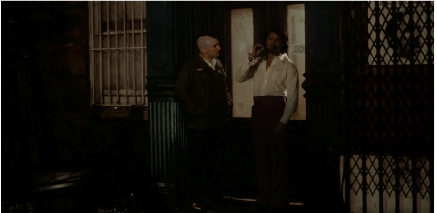
Arthur Jafa cast a replacement actor, right, as the pimp in “Taxi Driver;” originally played by Harvey Keitel, then skillfully wove in the new footage and rerecorded the voices.

In the original movie — what Jafa calls the “redacted version” — these characters, including Iris’s pimp Sport (played by Harvey Keitel), were white. That never felt right to Jafa. When he discovered that the film’s celebrated screenwriter, Paul Schrader, had intended Sport to be African American, he decided to “restore” the movie by introducing Black actors, except for De Niro and Foster. In the 73-minute-long film, titled “*****” — or as the artist pronounces it, “Redacted” — we see this recut version of the bloody climax over and over, each time slightly but crucially different. The result is extraordinary — both technically and conceptually — and brings to the surface the racist animus long accepted as underpinning Bickle’s barely contained rage. (Quentin Tarantino also criticized the decision to change the character to white in his 2022 book, “Cinema Speculation.”)