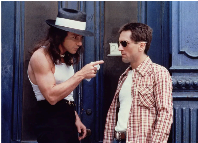
Harvey Keitel (left) as “Sport” Matthew, a pimp, and Robert De Niro as Travis Bickle in “Taxi Driver,” the 1976 film directed by Martin Scorsese.