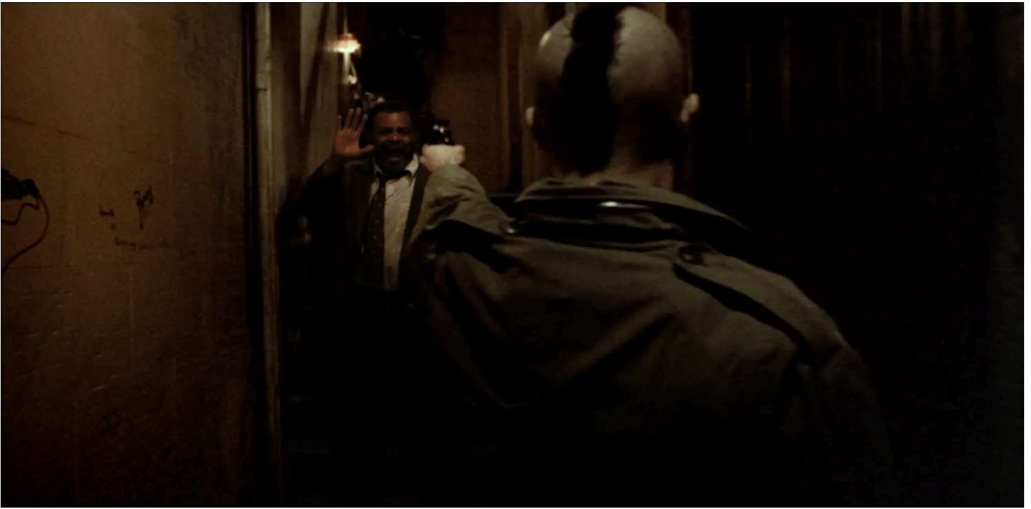
Film still from Arthur Jafa's "*****," 2024. The artist's recut version shows the bloody climax over and over, each time slightly but crucially different, with Black actors added in the roles of the night manager (shown) and pimp. It opened in a new exhibition at the Gladstone Gallery. via Arthur Jafa and Gladstone Gallery