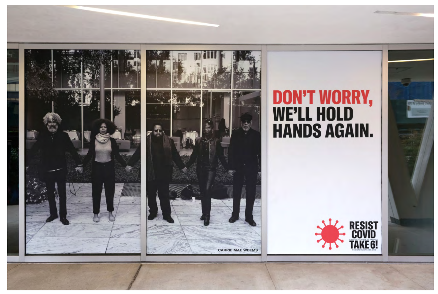
A photograph from the campaign on the entrance to BRIC in Brooklyn

The project has since expanded to several cities across the US, including Atlanta, Chicago, Dallas/Fort Worth, Detroit, Durham, Nashville, Philadelphia, Sarasota, and Savannah.