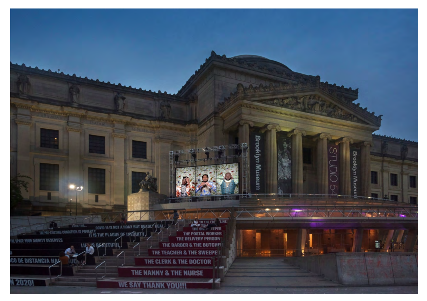
Weems's public art campaign " Resist Covid / Take 6! " presented at the Brooklyn Museum. (installation view of "Art on the Stoop: Sunset Screenings" at the Brooklyn Museum, September 09,2020- November 08,2020)

In addition to the Lincoln Center presentation, Resist Covid / Take 6 ! installations are currently up at the Apollo Theater, BRIC, the Brooklyn Museum, and the New School in New York.