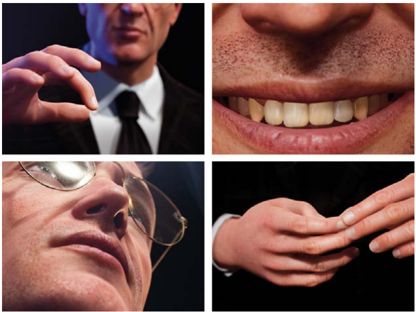
Four stills from Ed Atkins's The Worm, 2021, digital video projection, color, sound, 12 minutes 40 seconds.

The sound of The Worm is penetrative, and the image is immersive; the avatar appears as "a country of pores, wrinkles, and, I hope, the tiny inflections and winces of a detailed, silent response." So what kind of realism is at stake here? The video is hardly realist in the old sense of referential; its setup is entirely artifactual. Yet Atkins seeks not to reiterate the technological derealization of the world so much as to resist it. His aesthetic goal is to "model those parts of life that steadfastly elude representation." "That's my utopianism: a faith in the eternal singularity of materiality," which he locates above all in "the irreducibility of IRL/mortal experience." This realism is rooted in the body and the psyche, especially in extreme states of abjection and trauma (Atkins is interested in Kristeva and Lacan as well as Bataille).<sup>6</sup> It is the real as remainder, understood as that which resists the symbolic order—its task made all the more difficult given that this order is now supported by technologies of computer generation, artificial intelligence, and algorithmic scripting.<sup>6</sup>