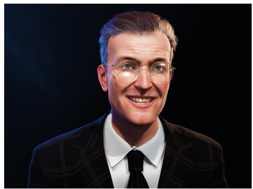
Ed Atkins, The Worm, 2021, digital video projection, color, sound, 12 minutes 40 seconds.

Atkins signals a shift among artists steeped in new media. Just as the Pictures artists once assumed the society of the spectacle so that they could engage its image repertoire, so Atkins takes computer-generated technology as a given but attempts to "misuse" it critically. Here he differs from the practice of immediate predecessors such as Harun Farocki, Trevor Paglen, and Hito Steyerl, for, rather than reiterate how the human is given over to technology, he seeks, perhaps impossibly, to bend technology back toward the human. His true utopianism is that he believes technology might aid the human to become human again—to become emotive and empathic on our own terms. His art is not a lament for humanism or a celebration of posthumanism but a snatching of a neohuman from the belly of the beast.<sup>12</sup>