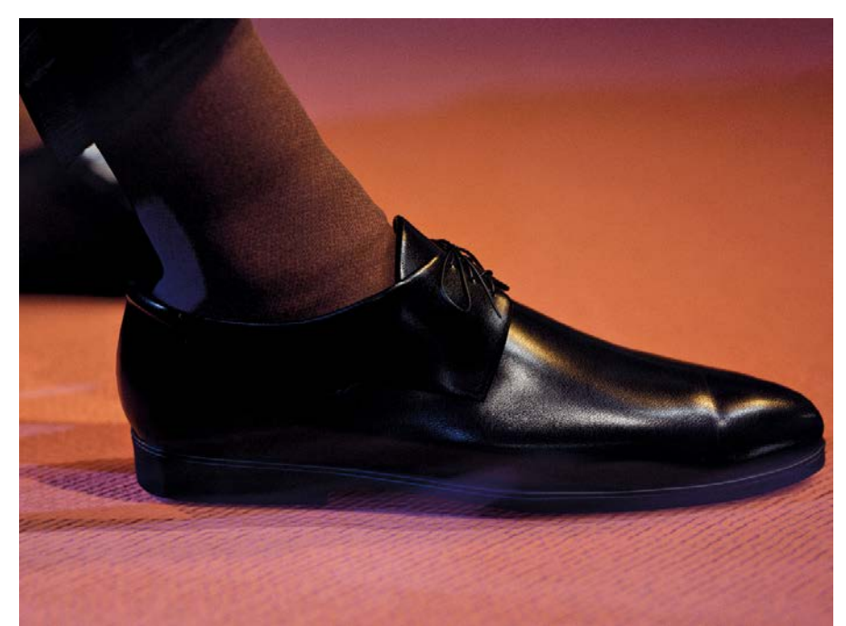
Ed Atkins, The Worm, 2021, digital video projection, color, sound, 12 minutes 40 seconds.