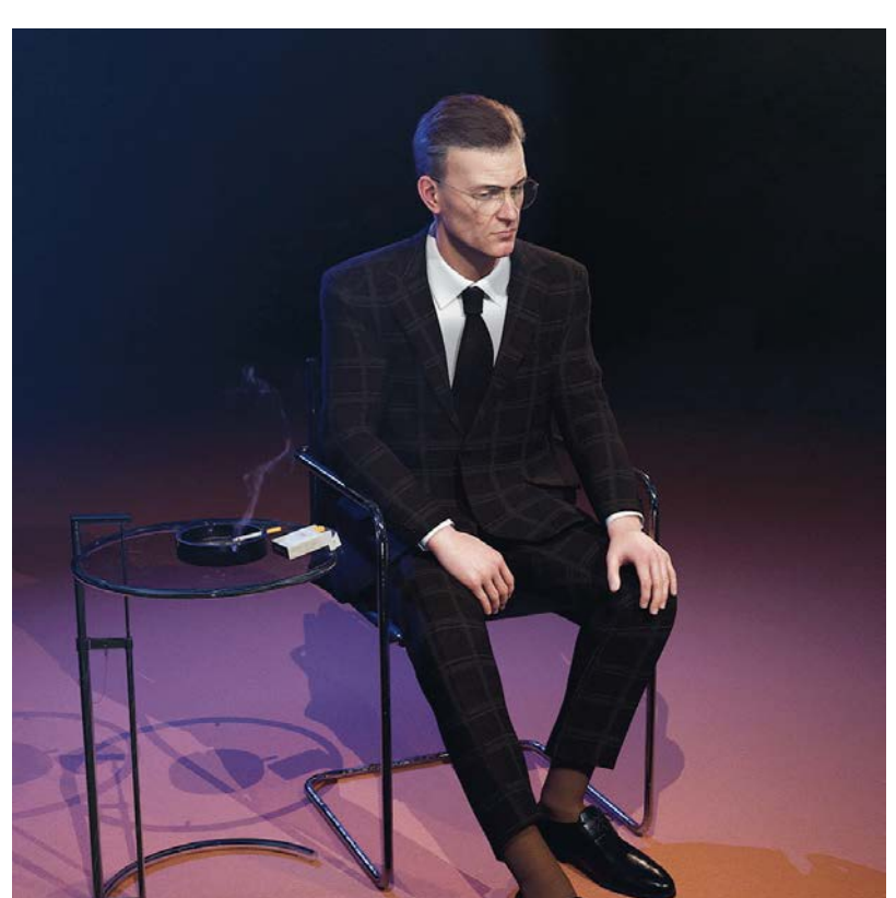
Ed Atkins, The Worm, 2021, digital video projection, color, sound, 12 minutes 40 seconds.

CLOSE-UP: YOUR LOSS Hal Foster on Ed Atkins's The Worm , 2021