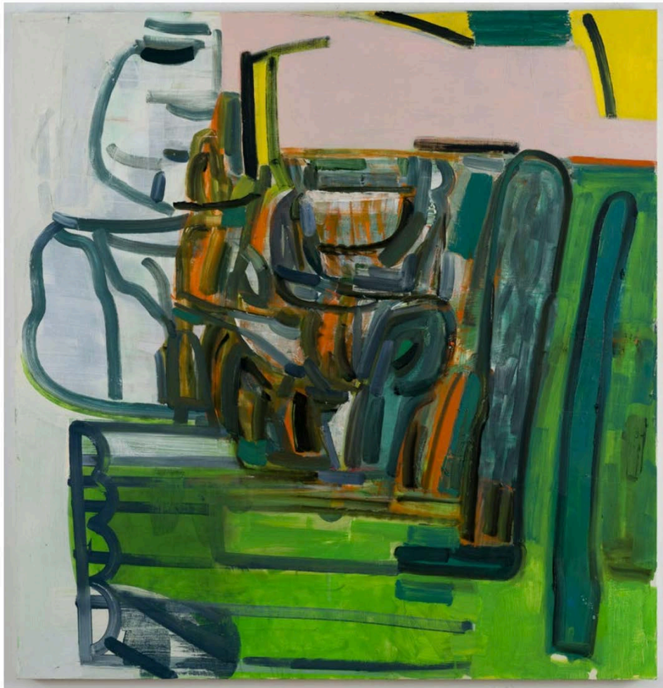
Amy Sillman, Untitled (green) , 2020. Acrylic, ink, and oil on canvas, 51 x 49 inches. © Amy Sillman. Courtesy the artist and Gladstone Gallery, New York and Brussels.