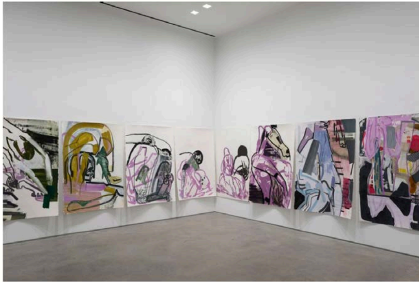
Installation view: Amy Sillman: Twice Removed , Gladstone Gallery, New York, 2020. Courtesy the artist and Gladstone Gallery, New York and Brussels.

pigments that blanket the entire picture. Within this group, the surface of Split 4 (2020) incorporates such a range of textures, you could look at it endlessly and never think it's the same painting. Split 3 (2020), meanwhile, has multiple dark, dash-like marks that literally hover in front of passages of yellow. None of the three with verdant tones suggest landscapes. Being somewhat clunky and awkward, yet emphatically bold and sui generis , these works with color mostly extend concerns Sillman has previously addressed.