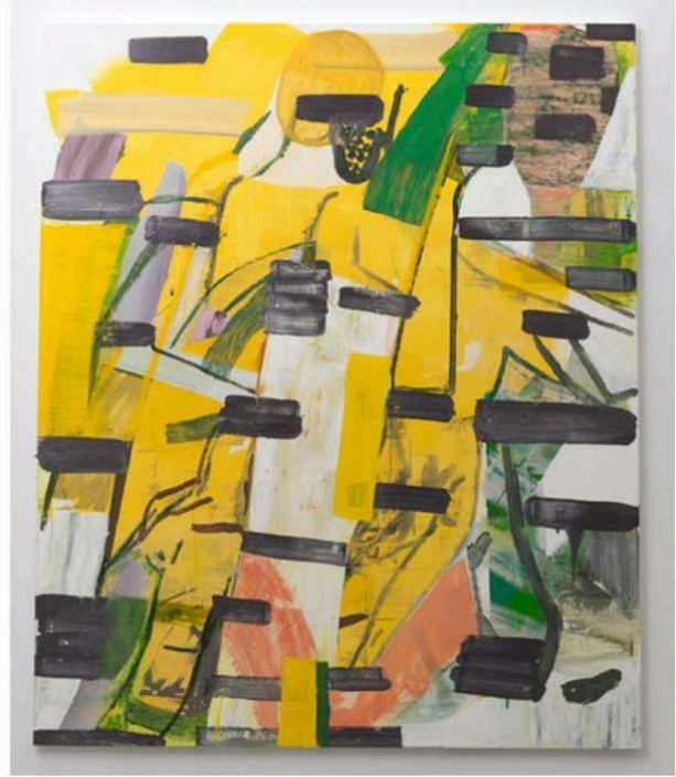
Left: Amy Sillman, Split 4 , 2020. Right: Split 3 , 2020. Acrylic and oil on linen, 72 x 60 inches each.

Then, too, Sillman is comfortable working with oil paints as well as acrylics. Sometimes, she uses both mediums on the same canvas. Depending on what she needs, she'll exploit their inherent qualities, ranging from tactility to fluidity. In a few works at Gladstone, Sillman commingles a number of different processes as if she were illustrating a how-to-make-a-painting manual. With brushes, spatulas, and other application tools, she dabbed, scrapped, covered over, dripped, poured, scumbled, caked, layered, and stroked every which way. If you're familiar with Richard Serra's Verblis (1967–68), which is associated with ways to make sculpture, you can picture Sillman putting together her own compilation based on how to apply paint to canvas or linen.