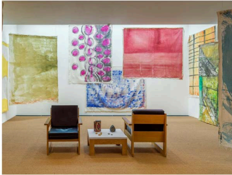
Vivian Suter, "Bonzo's Dream," 2020, Installation view, Brücke-Museum, Berlin, Foto: Roman März. Courtesy of the Artist und Gladstone Gallery, New York /Brüssel; House of Gaga; Karma International und Projectos Ultravioleta.

The museum provides a warm setting for Suter's work. Far from a big, echoey gallery, the institution backs into a forest, and features soft carpeting, skylights, and lounge chairs in a space that winds around in a loop. Suter's works hang from the ceiling, drape onto the floor, and cover the walls. They move gently when viewers walk by.