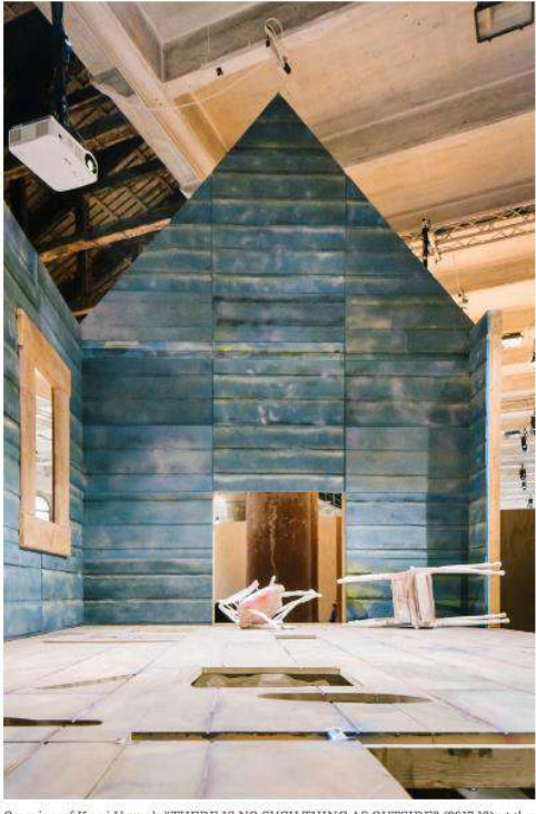
One view of Kaari Upson's "THERE IS NO SUCH THING AS OUTSIDE" (2017-19) at the

But the 79 artists and collectives here are almost all known quantities. A dismaying percentage of the art has already been shown in New York, Los Angeles, London or Berlin, and the globalism of the biennial's last two editions has been jettisoned for Western institutional preapproval. I walked out having discovered precisely two exciting artists I didn't know: Handiwirman Saputra, an Indonesian whose disjunctive sculptures — including off-kilter columns and pink loops that are like giant rubber bands — enact surprising contrasts of scale, shape and surface; and the promising young Indian photographer Soham Gupta, who shoots empathetic, night-swallowed portraits of those living on the margins of Kolkata.