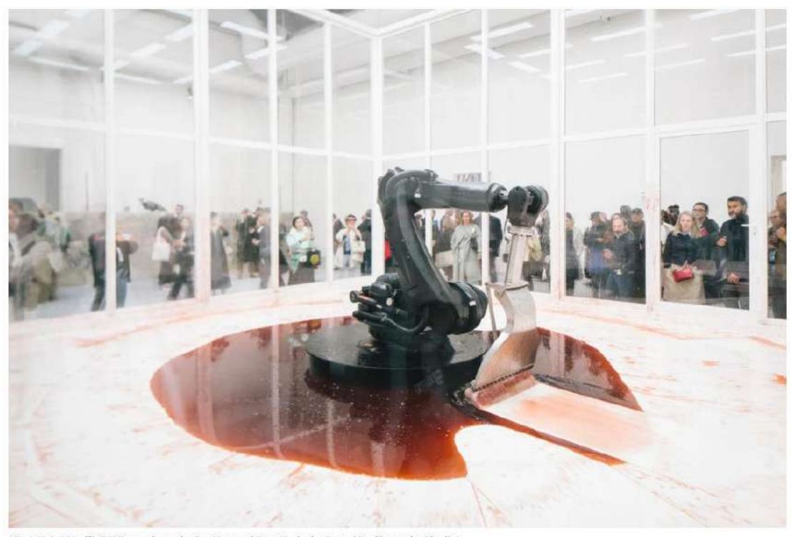
"Can't Help Myself" (2016), a sculpture by Sun Yuan and Peng Yu, in the Central Pavilion at the Giardini.