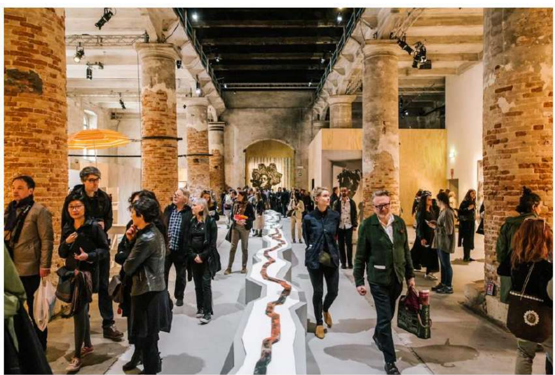
Visitors pass *Veins Aligned" (2018), by Otobong Nkanga.

The conceit of Mr. Rugoff's show — and it's a good one on paper — is to have shrunk the number of participants and asked each to contribute at least two works, which appear in two rhyming shows in two different locations. At the larger of them, the Arsenale (Venice's former naval yard), he has devised a system of plywood walls that avoids the rat-maze feel of some previous editions. Large installations, including an engrossing effort from the Los Angeles-based artist <u>Kaari Upson</u> that probes the psychological pressures of housing through urethane casts of furniture and cuckoo video performances, have ample breathing room.