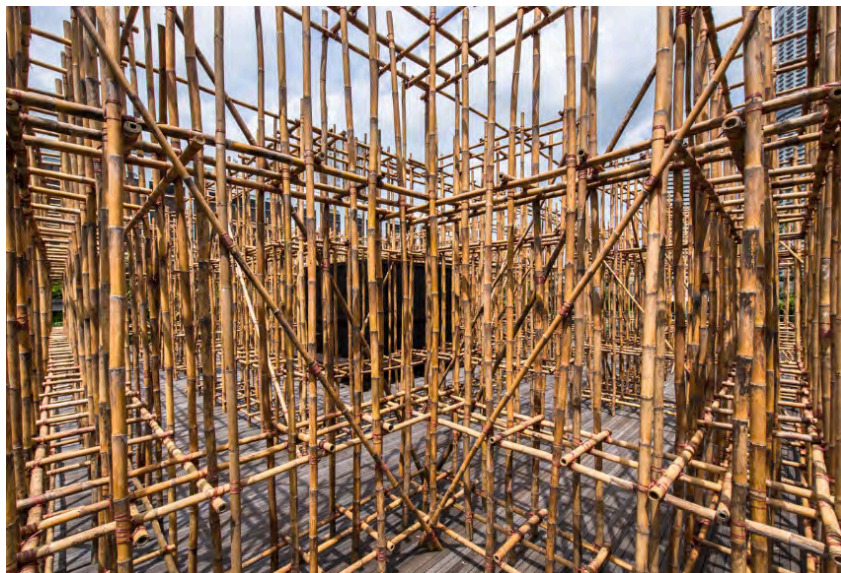
Rirkrit Tiravanija, Untitled 2018 The Infinite Dimensions of Smallness , 2018, Singapore.