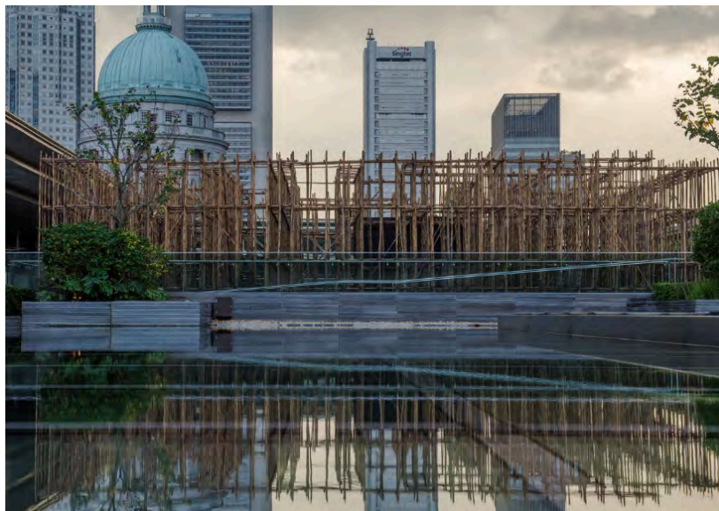
Rirkrit Tiravanija, Untitled 2018 The Infinite Dimensions of Smallness , 2018, Singapore.