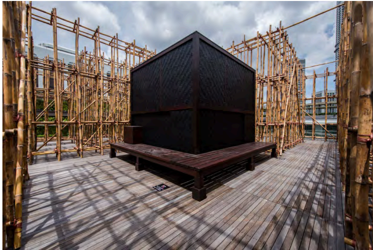
Rirkrit Tiravanija, Untitled 2018 The Infinite Dimensions of Smallness, 2018, Singapore.