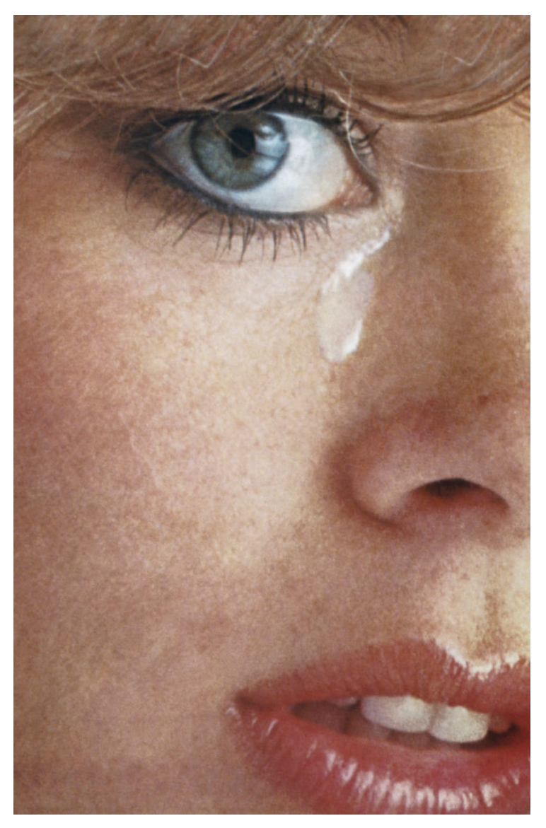
Anne Collier, Woman Crying #1, 2016. C-print. 35.26 x 53 inches. Courtesy the artist and Anton Kern Gallery, New York.

the end of the nineteenth century, that onomatopoeia had entered colloquial use as we know it today: an ersatz copy of something purportedly truer and more deeply felt. There are always people onscreen or encased by a viewfinder whose emotions seem simultaneously manufactured and awash in authenticity. Each time, we feel that we have seen these people before, that they are a cliché; and each time we set that knowledge aside and view them with newly astonished eyes.