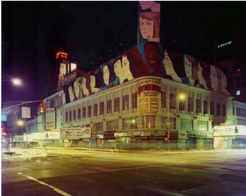
"Times Square Mural," from 1977.