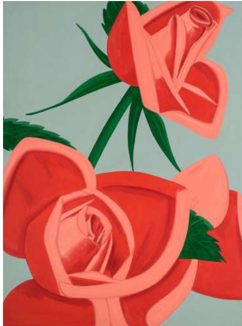
"Rose Bud," from 1967.

Being off the bubble was "a bit of a shock," Katz admitted, but it didn't slow him down. He had no doubts about his work, and there were always people who believed in him. In the fifties and later, he had been close to Frank O'Hara, James Schuyler, John Ashbery, and other New York poets. "They liked my paintings and I liked their poetry," he said. O'Hara reviewed Katz's work favorably in ARTnews and elsewhere, and bought two of his paintings in 1960. "I think Katz is one of the most interesting painters in America," O'Hara wrote. "He has the stubbornness of the 'great American tradition' in the dominating face of European influences." O'Hara was in Katz's studio at four o'clock one morning, telling him what to do, Katz recalled. "I said, 'Listen, Frank, I know how good I am,' and he said, 'Don't get porky with me. You're the one who's going to have to hang near Matisse.'" Katz's career might have taken a different path if O'Hara, who became an assistant curator at the Museum of Modern Art in 1960, hadn't died in 1966—he was hit by a beach buggy one night on Fire Island.