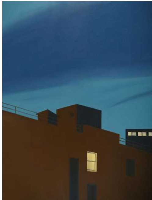
"SoHo Morning," from 1987.

Ada, who has a way of being there and not there, went off to sit by herself on a bench outside. She had made it clear from the beginning that she did not want to be interviewed. ("I'm not part of this," she said.) "I think sometimes she's really bored," Katz admitted. "I'm a little difficult, because I do what I want to do. I spend most of the summer painting, and she's not particularly social, so a lot of the time she's by herself. She reads a lot. When Vincent's here everything's O.K., but Vincent isn't here that much, and I'm not going to stop painting to entertain her." Has she ever complained about that?, I asked him. "No," he said. He likes to tell about the time when, at one of his openings, a person asked, "Is that the artist?" and someone else said, "It must be, he's standing with Ada."