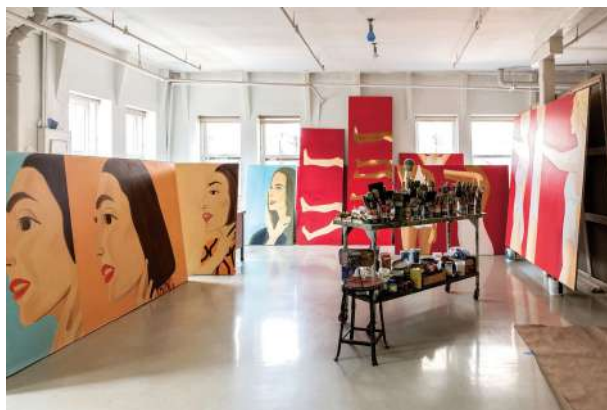
Katz’s New York studio, on West Broadway, where his recent work includes a series he calls “Coca-Cola Girls” (on the right), inspired by advertising signs from the fifties.

Moving deliberately, Katz climbed five steps to the top of a creaky wheeled platform and started applying ultramarine to the upper-right section of the canvas, using a housepainter’s six-inch-wide brush. The paint went on easily, in smooth, unhurried strokes, back and forth and diagonally. One of his rules is “no noodling,” which means no fussy brushwork. He came down, moved the platform a few feet to the left, and climbed up again to do the next part. Every now and then he paused to consult the smaller sketch, which he had with him on the platform, or the warmup canvas. He kept going back over the painted areas, to adjust the tone. “I’m not sure the blue is right,” he said, at one point. “We’ll see when the black comes into play.” It took him about half an hour to finish the sky. Occasionally, between trips up and down the steps, he paused to wipe up drops of paint that had fallen beyond the brown paper he’d laid on the studio’s faded but immaculate linoleum floor.