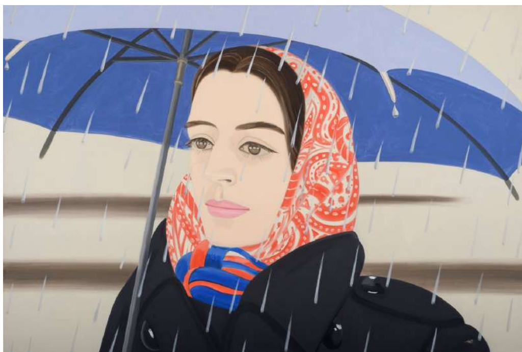
“Blue Umbrella 2,” from 1972.