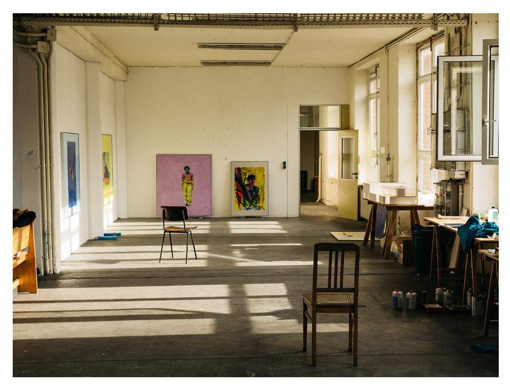
Two recently completed works (left wall) hang in the studio alongside works in progress (facing) and a mode of an exhibition space (right).

time between these cities and, more recently, his country of birth, Georgia. 'So far, I have had no problem living in different places,' he says, 'but I am starting to realise it would be good to decide so I am not scattered all over the world the whole time.'