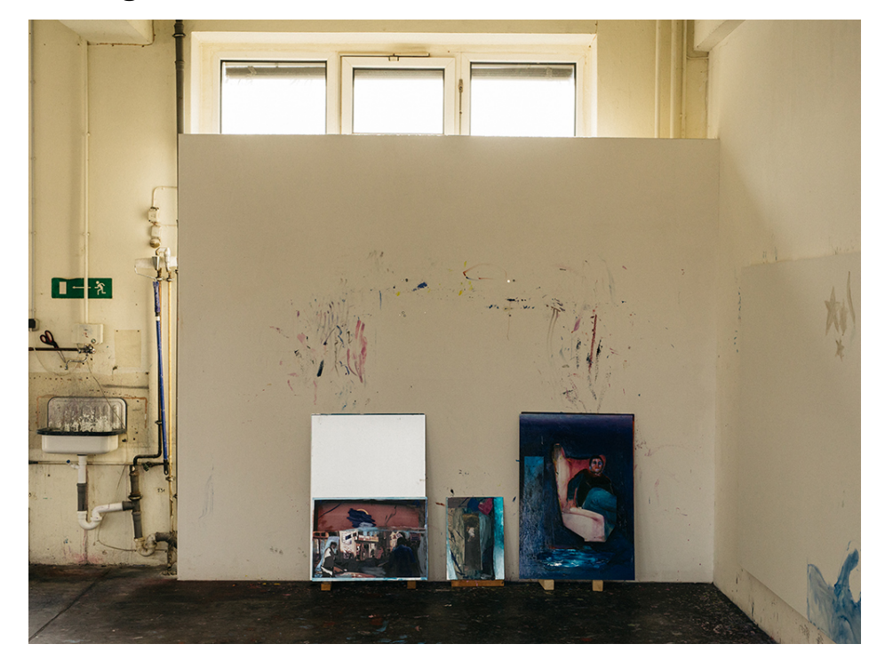
Works in progress, which began life as collages.

I ask him about the girl and the wolf, a theme that repeats itself in his sculptures. For many it is a motif dripping with narrative significance: Little Red Riding Hood, Studio Ghibli's Princess Mononoke or one of the Stark children from Game of Thrones. The figure is both innocent and warrior-like. But Wekua is adamant that storytelling is not his intent: 'They stand for something, but not someone. It is a sense of universal condition that moves me, that I express in one form or another. But that is not a story. If viewers want to see stories in my work, that is of course fine, but it would be great if they could grasp that condition as well.' He does not go on to elucidate what that condition might be.