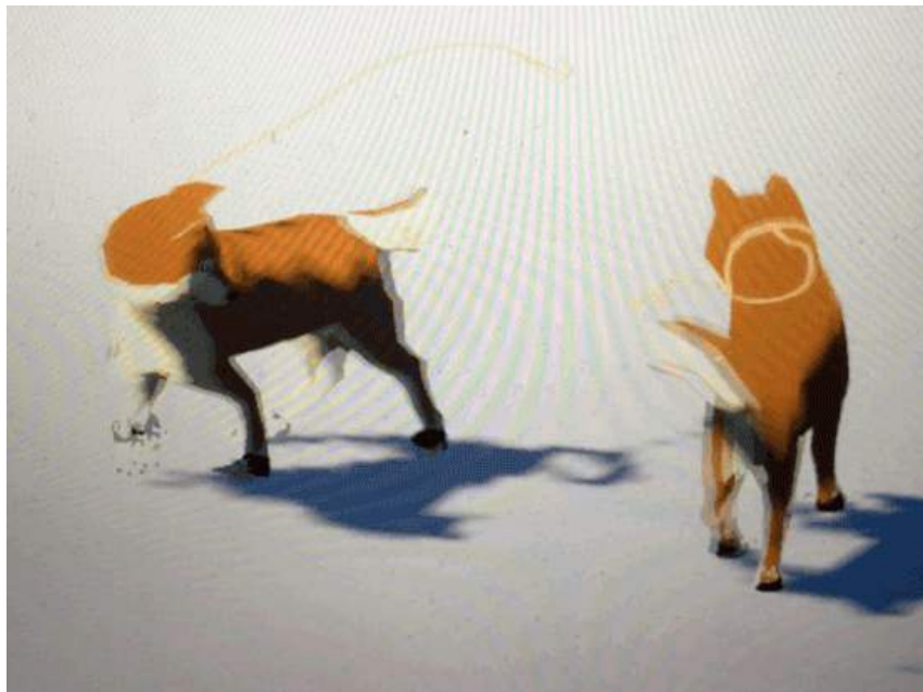
A.GIF from 'Emissaries.'

degree at the University of California at Berkeley and worked afterward at George Lucas's visual-effects and animation studio, Industrial Light & Magic. Instead of fawning over "Star Wars" characters, he gravitated to the company's research and development division, where he said researchers were toying with new ways to simulate natural phenomena like whirlpools.