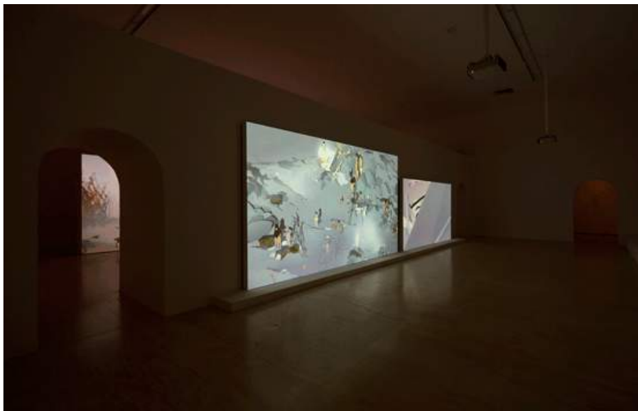
‘Emissaries’ installations at MoMA PS1, on view through Sept. 25.