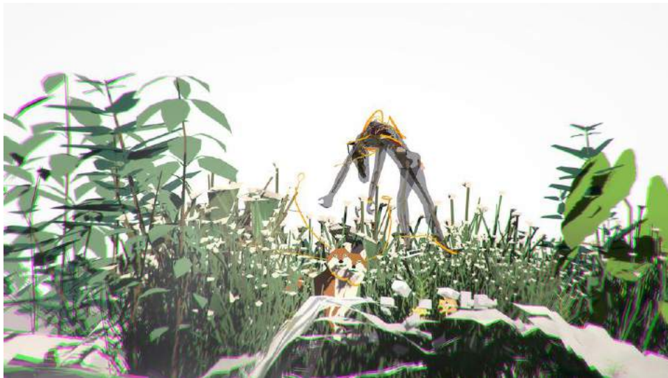
A scene from 'Emissary Forks at Perfection' live simulation.