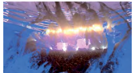
Pages 60–61: Palisades in Palisades (still, 2014)