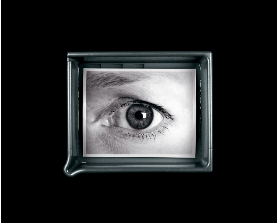
"Developing Tray #2 (Gray)" (2009)