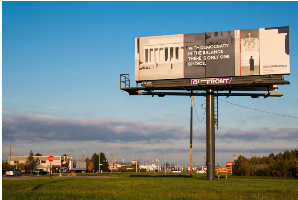
A billboard by Carrie Mae Weems for Hank Willis Thomas's For Freedoms project, entitled "With Democracy in the Balance There is Only One Choice," Cleveland, Ohio, 2016.