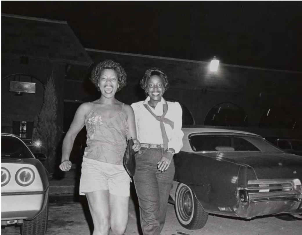
Carrie Mae Weems, "Welcome Home," 1978-84.

It's my opinion that artists like Carrie are rare in how they mobilize and inspire other artists who may have fallen into a state of despair, questioning the place of art in a moment in history when we are faced with growing threats of fascism, and an art world that is primarily concerned with market value. Artists like Carrie Mae Weems elevate the role of artists within the cultural and political landscape, and reinforce the concept of art as a catalyst for hope and change to come.