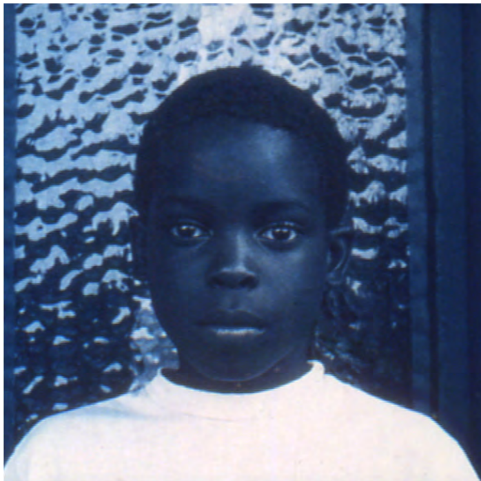
Carrie Mae Weems, "Blue Black Boy," 1997.

Here, eight contemporary artists reflect on Weems's art and activism. To some, she is a teacher or mentor, to others, a lifelong friend. To all of them, she is an icon.