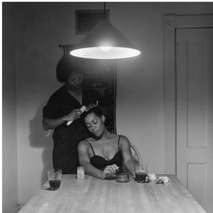
Carrie Mae Weems, "Untitled (Woman Brushing Hair)," 1990, from "The Kitchen Table Series."

She doesn't make concessions and that is part of what makes her a legend. She has never been seduced by fame or prizes or museum exposure. In fact, she occupies those financial and cultural spaces and opens them up to others. Her retrospective at the Guggenheim in 2014 — that could have very easily just been a midcareer exhibition of Carrie Mae Weems. It's a very different thing to use that opportunity to crack open the edifice of whiteness, if you will, and bring necessary voices into that space.