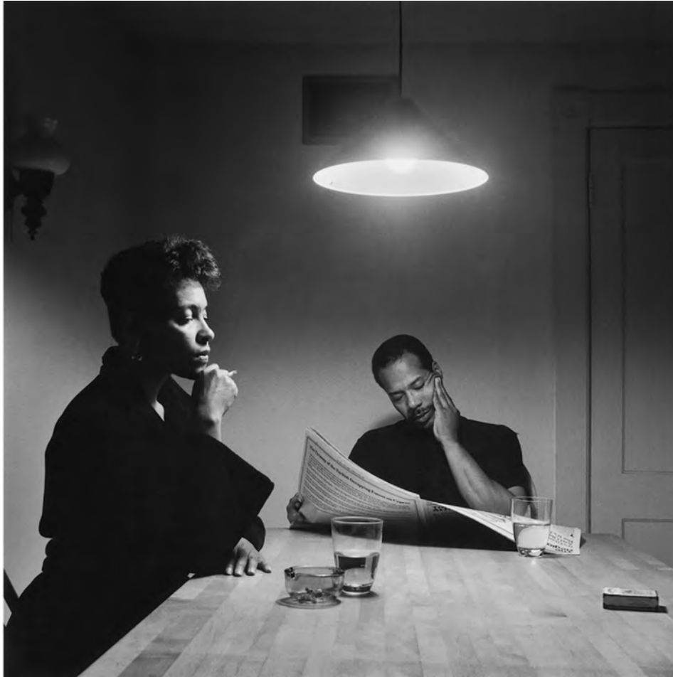
Carrie Mae Weems, "Untitled (Man reading newspaper)," 1990, from "The Kitchen Table Series."