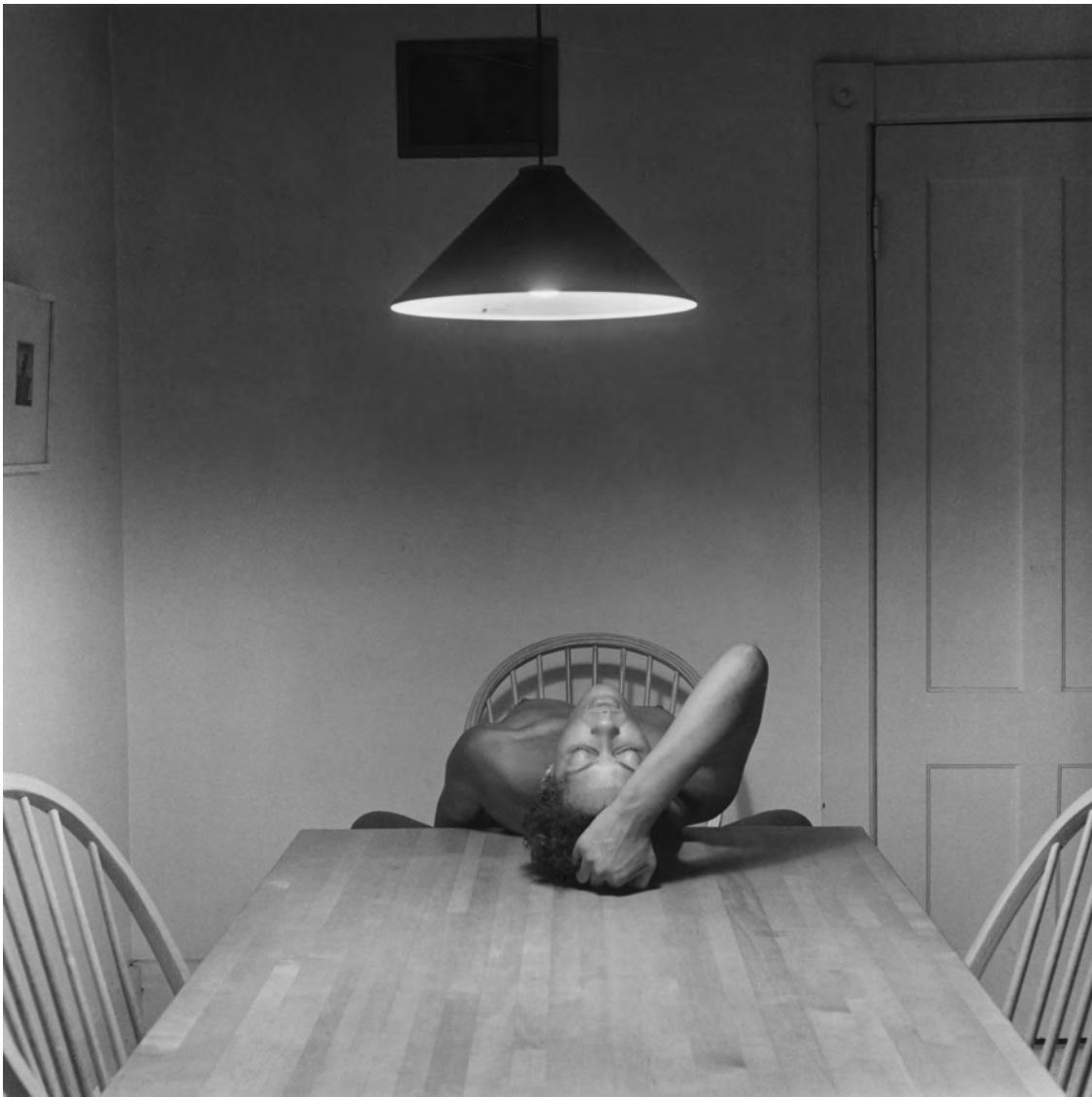
Carrie Mae Weems, "Untitled (Nude)," 1990, from "The Kitchen Table Series."

The artwork and art practice of Carrie Mae Weems impact American culture at large because she shows us how an artist and a citizen ought to be: selfless, caring, loving, empathetic and passionate about the work we do in the face of political corruption, bigotry, white supremacy and grave inequality. And for this, in my eyes, Carrie Mae Weems is a national treasure.