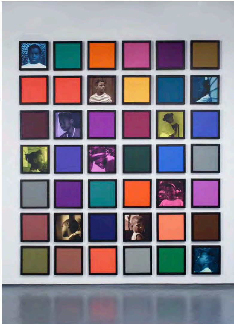
Carrie Mae Weems, "Untitled," 2009-10.

I was first introduced to the work of Carrie Mae Weems nearly 20 years ago, in my undergrad photography class at Edinboro University in Pennsylvania. As the only black female student in the classroom, I was struggling to speak about the portraits I was making with my mother and grandmother. My teacher pulled me aside one day and handed me a catalog titled "Carrie Mae Weems" (1993). The cover of the catalog struck me deeply, it was the portrait "Blue Black Boy" (from the "Colored People" series of 1989-90), and in that moment, I knew I was participating in a collective dialogue about race, class, gender, innocence, humanity and power with a community of black artists scattered throughout the world — with Weems at the helm. From bodies of work like "Family Pictures and Stories" (1981-82) in which Weems challenges and disrupts the ideology of Assistant Secretary of Labor Daniel Patrick Moynihan, who blamed "the deterioration of the fabric of Negro society" on a weak family structure, to "Colored People," in which she confronts the oversimplification of skin tone, how the black community internalizes colorism and how America uses it against us, Weems has found compelling and expansive ways to challenge how we think about race and class in America.