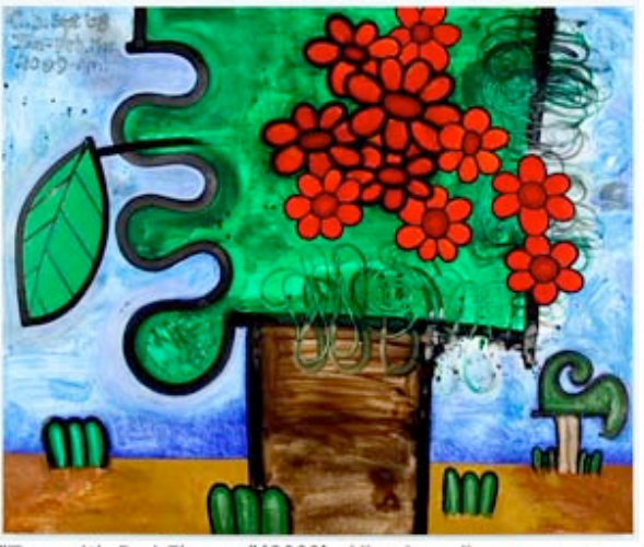
'Tree with Red Flowers" (2009). Mixed media on canvas, 75 × 90 inches (190.5 × 228.6 cm).

Rail: Certainly now with the recent body from work of the last two or three years where the linearity becomes more pronounced. Just to go back to the beginning, you went to Andover, where a group of distinguished and older alumni including Frank Stella, Carle Andre, Hollis Frampton, and a few others have gone. What was your experience there as a student?