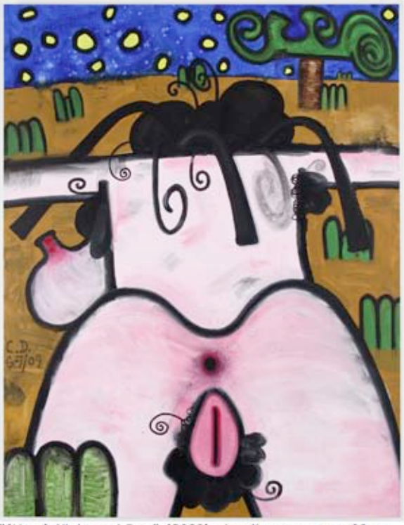
"(Hers) Night and Day" (2009). Acrylic on canvas, 66 × 51 inches (167.6 × 129.5 cm). Copyright Carroll Dunham. Courtesy Gladstone Gallery.

Dunham: I only came to them through drawing; the whole thing evolved visually. So there was never any question of my having a preconception of what I was going to be illustrating. As I've pointed out in the past, it isn't precisely that they're blind-it's just that they never developed eyes [laughter]. There is no particular metaphor about blindness in my mind; it's just that when I tried to draw characters in my work with eyes they didn't feel comfortable as part of the image, so I had to eliminate that feature altogether. What it means psychologically or how one might extrapolate a story