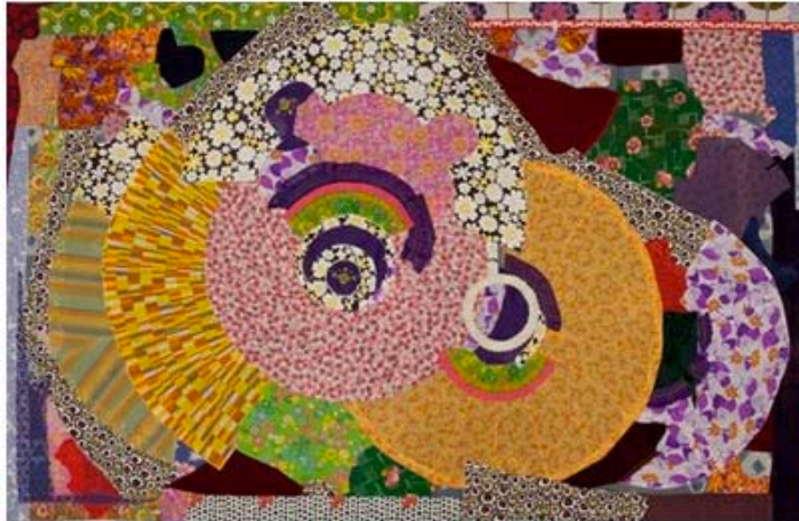
Noa Eshkol, Celebrating Circle (Wedding), 1980's Cotton, cotton velvet devoré velvet, polyester Noa Eshkol Foundation for Movement Notation, Holon, Israel

Though the dancers did not usually perform with sets, for these films Lockhart included panels of brightly colored abstract tapestries that have a story of their own.