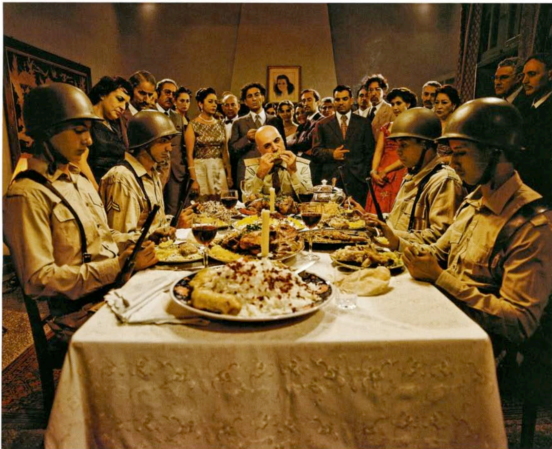
154 ART IN AMERICA JUNE/JULY'09

In the end, I learned that the fundamental difference between cinema and art is the question of character development. In all my past work, such as the videos Rapture [1999] and Passage [2001], I had treated people sculpturally, devoid of any character or identity. They were simply iconic figures. But with this film, I had to learn how to build characters, how to enter their inner worlds, their mindsets. This was an entirely new experience for me. I began to appreciate directors like Bergman, who could keep you pinned in your seat, some-