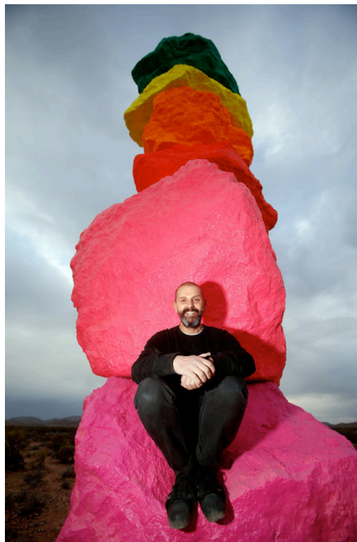
Ugo Rondinone with part of his new work, “Seven Magic Mountains”