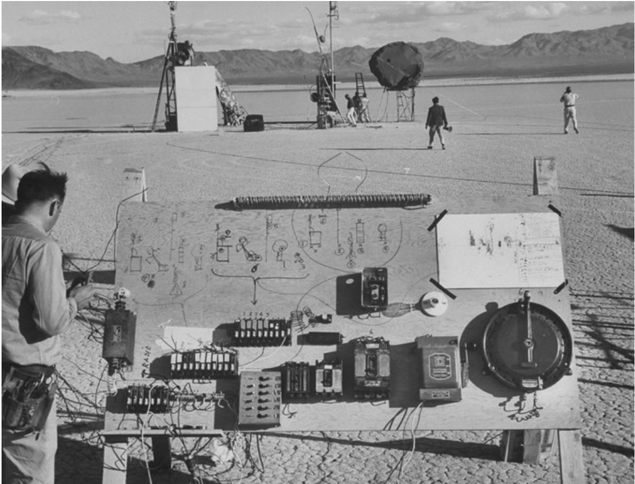
Jean Tinguely with his “Study for an End of the World, No. 2,” in which he detonated junk sculptures with explosives in 1962.

“Stacking stones is such a universal impulse, an activity that has gone on around the world as long as humans have been here,” said the Swiss artist Ugo Rondinone, climbing from a sport utility vehicle to see for the first time the project he had been working on for more than five years, “Seven Magic Mountains,” his largest public art installation and one of the most ambitious pieces of his career.