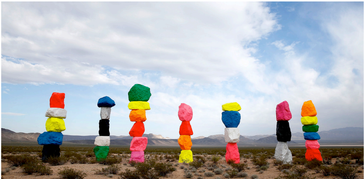
"Seven Magic Mountains" by Ugo Rondinone near Jean, Nev.

JEAN, NEV. — The vast desert around this tiny road-stop town has tantalized artists for at least a couple thousand years. Ancient petroglyphs of lizards and unidentifiable creatures dot canyon walls to the northeast. In 1962, Jean Tinguely staged "Study for An End of the World, No. 2," in which he detonated junk sculptures with explosives that he and Niki de Saint Phalle had carefully assembled in their room at the Flamingo hotel in Las Vegas, up the road. And six years later, Michael Heizer created one of his first earth works here, a zigzag trench incised like an abstract painting into the surface of a dry lake bed.