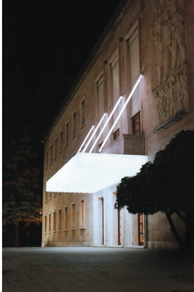
Marquee Tirana, 2015, metal frame, neon, LED, opalescent Plexiglas, 1200 × 400 × 83 cm.