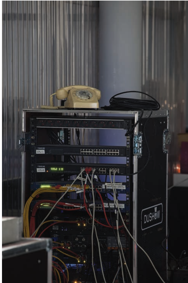
above Anywhere, Anywhere, Out of the World , 2013 (installation view, Palais de Tokyo, Paris).