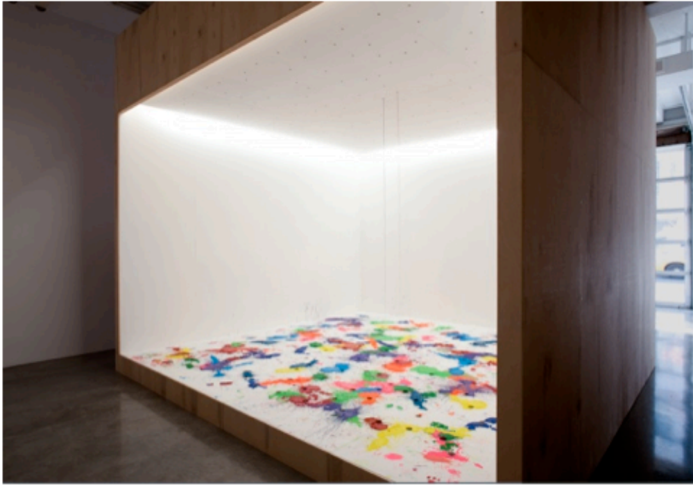
Jim Hodges, Untitled , 2011

"Jim Hodges at Gladstone Gallery," Mousse Blog , December 9, 2011.