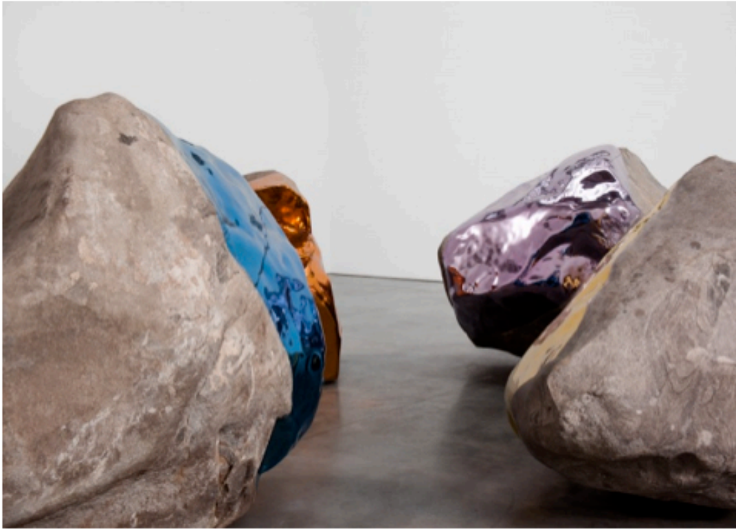
Jim Hodges, Untitled , 2011

"Jim Hodges at Gladstone Gallery," Mousse Blog , December 9, 2011.