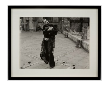
8 Jack Smith, Untitled (from 'I Danced with a Penguin'), c. 1983.