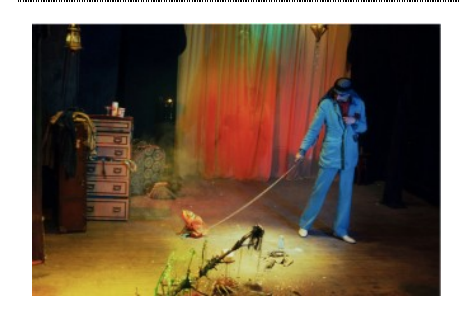
10 Jack Smith, The Secret of Rented Island (Documentation of a performance with 35 mm slides and recorded audio), c. 1977 (assembled 1997).