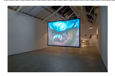
2 View of Jack Smith, "Theater and Performance Works," The Modern Institute, Glasgow, 2015.