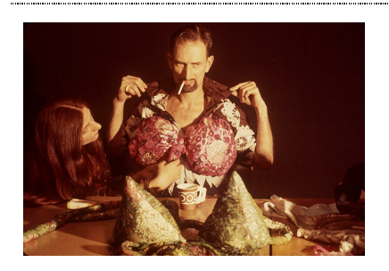
7 Jack Smith, Irrational Landlordism of Bagdad (a.k.a. Material Landlordism of Bagdad, a.k.a. The Secret of the Brassiere Factory), Cologne Art Fair, Germany, October 26-31 (detail), 1977.