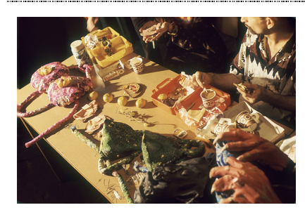
6 Jack Smith, Irrational Landlordism of Bagdad (a.k.a. Material Landlordism of Bagdad, a.k.a. The Secret of the Brassiere Factory), Cologne Art Fair, Germany, October 26-31 (detail), 1977.