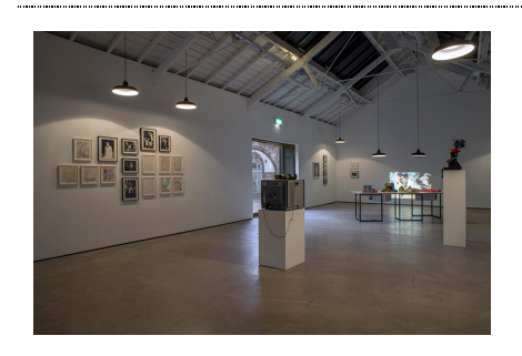
3 View of Jack Smith, "Theater and Performance Works," The Modern Institute, Glasgow, 2015.