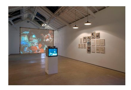
1 View of Jack Smith, "Theater and Performance Works," The Modern Institute, Glasgow, 2015.

At the other end of the space, however, is a dense handwritten script for a performance called Irrational Landlordism of Bagdad . Also known as Material Landlordism of Bagdad or even The Secret of the Brassiere Factory , and first performed at Cologne Art Fair in 1977, it