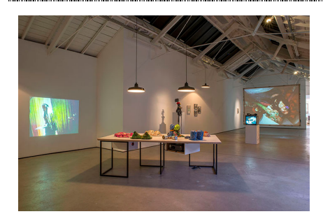
11 View of Jack Smith, "Theater and Performance Works," The Modern Institute, Glasgow, 2015.