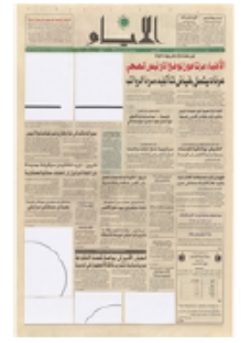
National Gallery of Art

9,000 sheets of big paper, so the stack can keep being replenished as visitors walk off with the artwork.