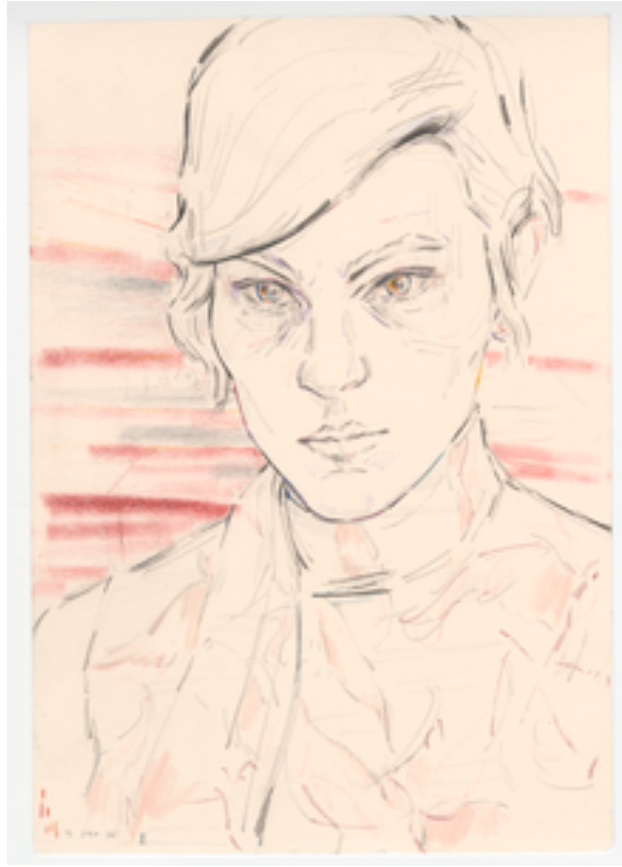
Elizabeth Peyton, Dirty Pink Heron, 2016