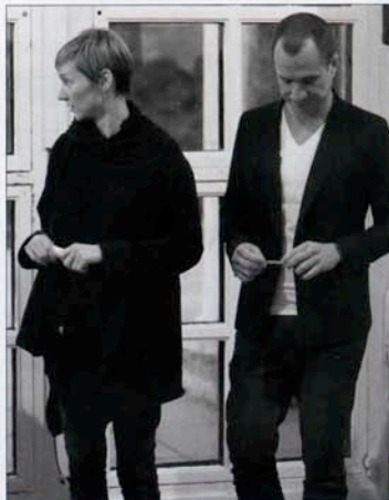
For their 2006 work Clamor , Jennifer Allora and Guillermo Calzadilla researched the design of defensive bunkers and the history of military music, creating a squat structure that issues a din of intermixed war songs from various cultures.