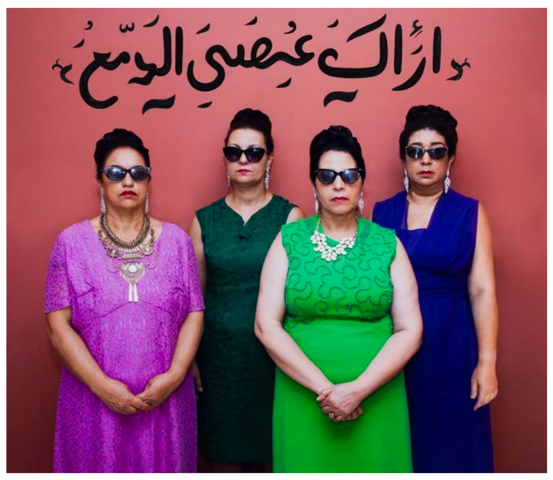
"I See You Holding Back the Tears," 2018 © Shirin Neshat