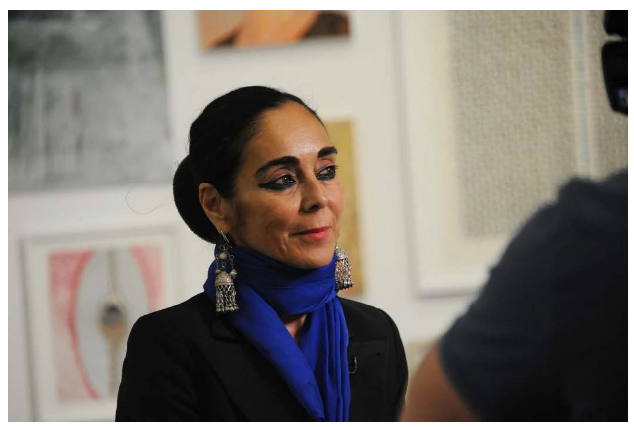
The artist at her opening of "A Bridge Between You and Everything"

It's really about being a part of community and being a woman who has a feminist twist to her work. My subjects have always been women. I'm interested in stories being told by other women. I've always taken inspiration from other artists, especially other women artists from Iran.