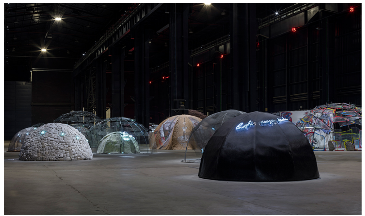
mario merz, "igloos", exhibition view at pirelli hangarbicocca, milan, 2018 courtesy pirelli hangarbicocca, milan photo: renato ghiazza © mario merz, by siae 2018

gathered from numerous private collections and international museums — including madrid's reina sofia, london's tate and berlin's nationalgalerie — the exhibition curated by <u>HangarBicocca's</u> vicente todolí provides an overview of merz's work. overall, the show highlights how the artist developed