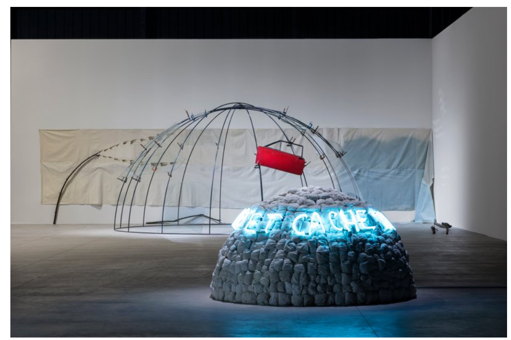
mario merz igloos, exhibition view at pirelli hangarbicocca, milan, 2018. © mario merz, by siae 2018