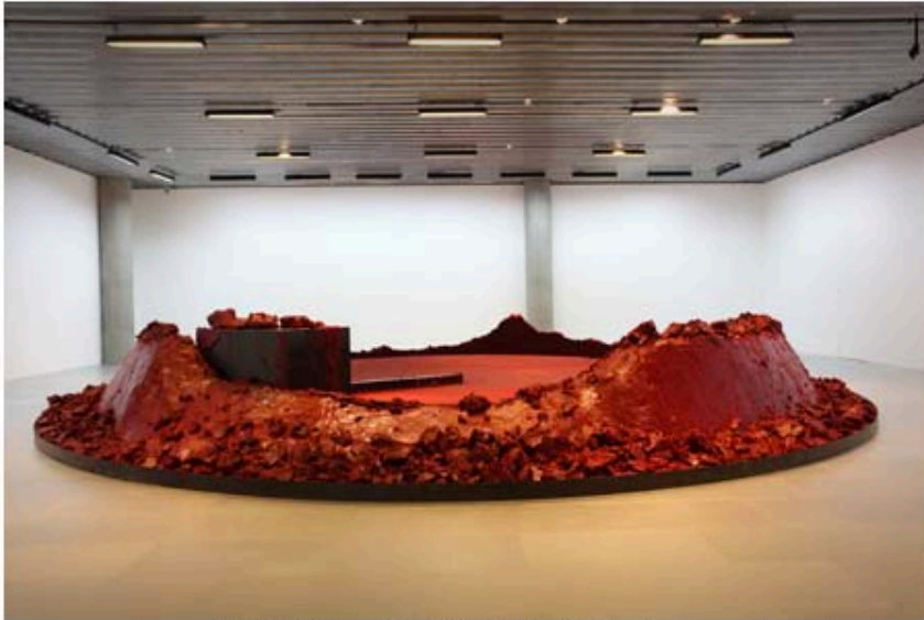
"My Red Homeland" (2003) by Anish Kapoor