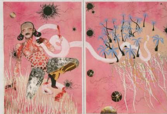
WANGECHI MUTU.

well to all of us savages who, over generations, have traveled between old and new worlds.