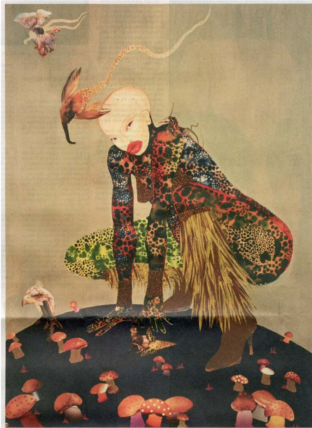
WANGECHI MUTU. COLLECTION OF PETER NORTON, NEW YORK

Holland Cotter, "A Window, Not a Mirror," The New York Times , October 11, 2013, p. C21, C32.