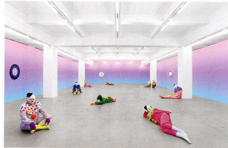
Cover: Design by Ugo Rondinone for Art in America , 2014, crayon on paper, 5¾ by 4¾ inches. Above, view of Rondinone's exhibition "Breathe Walk Die," 2014-15, at the Rockbund Art Museum, Shanghai. See Contributors page.

As she prepares to represent Switzerland at the Venice Biennale this spring, the artist speculates on the science of cat pheromones, evolutionary theory and mineral-water marketing strategies.