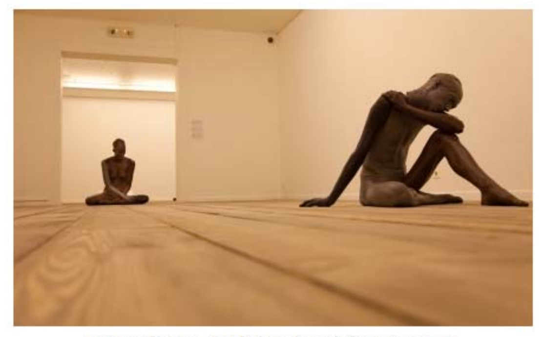
Ugo Rondinone - Nude (2012), Cycladic Art Museum