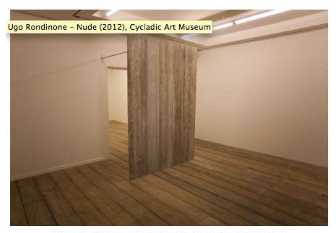
Ugo Rondinone - Nude (2012), Cycladic Art Museum

Creahan, D., "Athens – Ugo Rondinone: "Nude" at the Museum of Cycladic Art through October 15<sup>th</sup>, 2012, Art Observed, September 4, 2012.