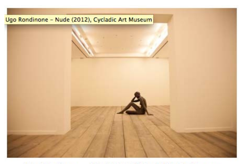
Ugo Rondinone - Nude (2012), Cycladic Art Museum

Creahan, D., "Athens – Ugo Rondinone: "Nude" at the Museum of Cycladic Art through October 15<sup>th</sup>, 2012, Art Observed, September 4, 2012.