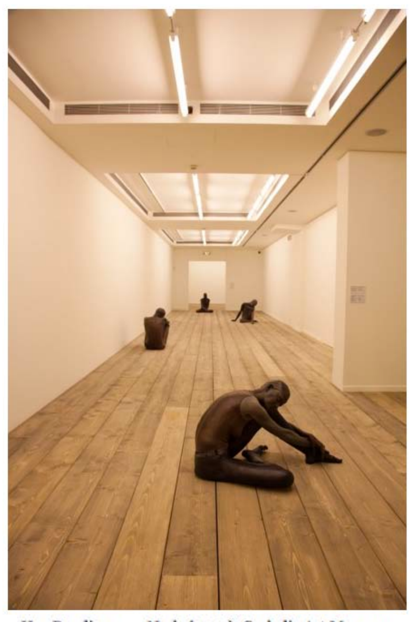
Ugo Rondinone - Nude (2012), Cycladic Art Museum

Given the contents of the rest of the museum, Rondinone's installation stands as a comparison to classic Greek modes of human figuration, and calls conventions of beauty and artistic value to the forefront. At the same time, his works serve to crucially alter the structure of their exhibition space, placed with an aesthetic sense akin to that of Zen rock gardens. Exploring the nature of space and location through the placement of the human form, Rondinone creates interesting dialogues on our presence in the world, and what it means for our surroundings.