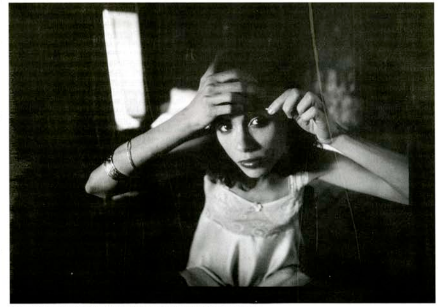
Shirin Neshat, Film Still, "Zarin" (2005). Copyright Shirin Neshat. Courtesy Gladstone Gallery

Shirin Neshat's current exhibit, Games of Desire , will be on view from September 3–October 3, 2009 at Gladstone Gallery on 12 Rue due Grand Cerf, Brussels.