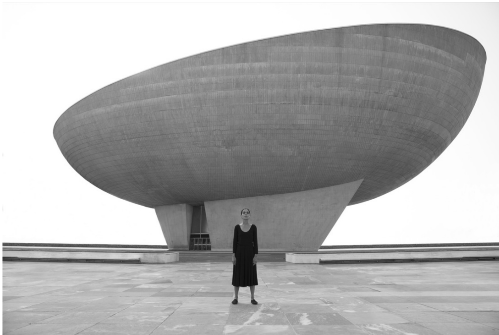
Shirin Neshat, still from Roja (2016).

Shirin Neshat doesn't make a lot of work. Her endeavors with film are, in her words, "a real test of endurance." These projects can take years to evolve, she tells me. Neshat has recently returned from a preparatory trip to Morocco for her next feature, which will finally come to fruition after six years of planning (shooting begins in the fall). And while for her 2009 film, an adaptation of Shahrnush Parsipur's novella, Women Without Men , Neshat constructed Tehran in Casablanca, for this forthcoming one, she'll return to the city to build Cairo.