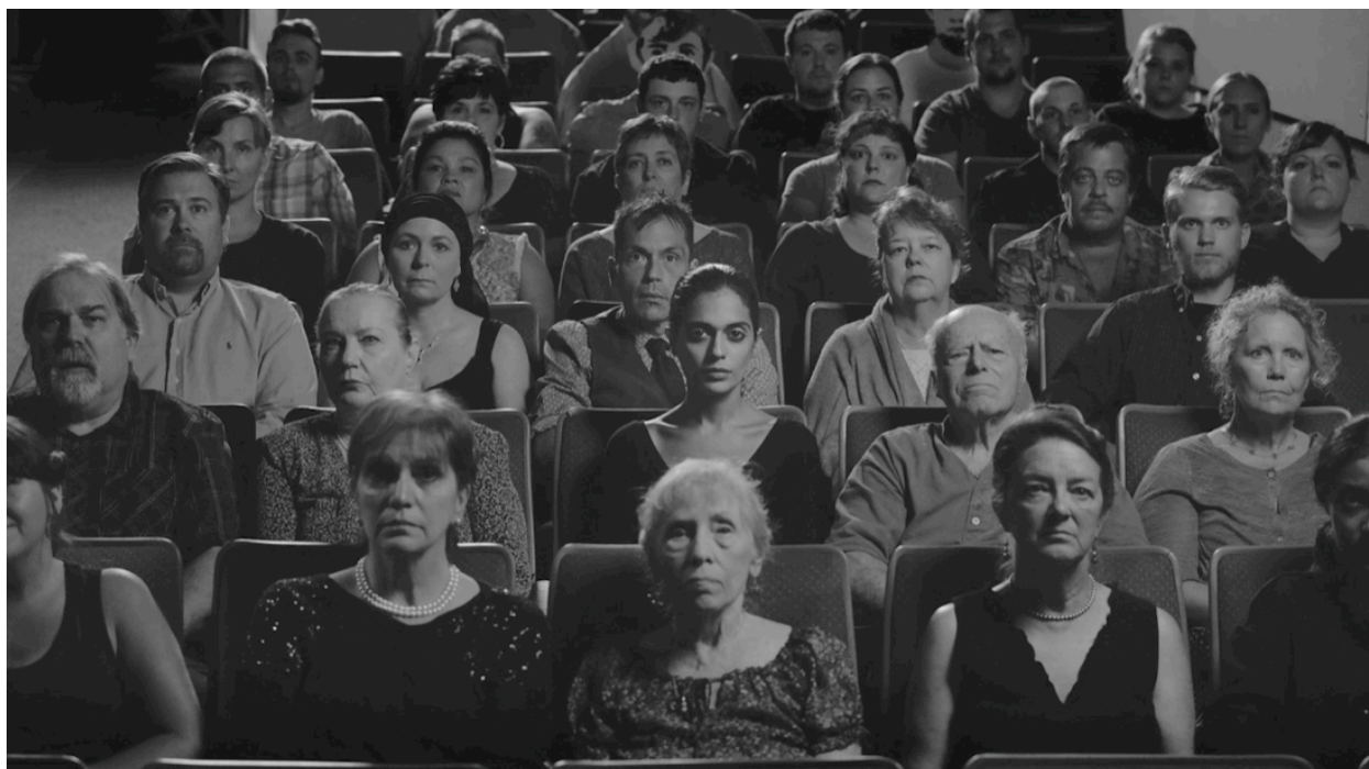
Shirin Neshat, still from Roja (2016).

Neshat says. Sara is like a female imagining of Dante, wandering lost and wide-eyed through a dark forest; while Roja (physically resembling the artist herself) is both strong and sentimental. “The advantage of working with people who have never acted before is that they take the role very seriously and give it their hundred percent,” Neshat explains.