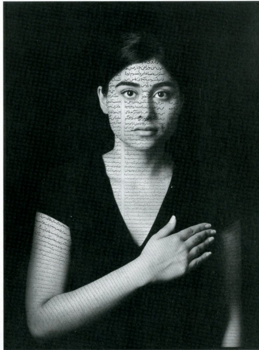
Nida (Patriots) , from The Book of Kings series, 2012, ink on LE silver gelatin print, 152 x 114 cm

Shirin Neshat: Afterwards is on view at Mathaf: Arab Museum of Modern Art, Doha, through 15 February; her exhibition The Home of My Eyes is at Yarat Contemporary Art Space, Baku, from 23 March through 23 June; and later this year, Shirin Neshat: Facing History can be seen at the Hirshhorn Gallery, Washington, DC, 19 May – 20 September