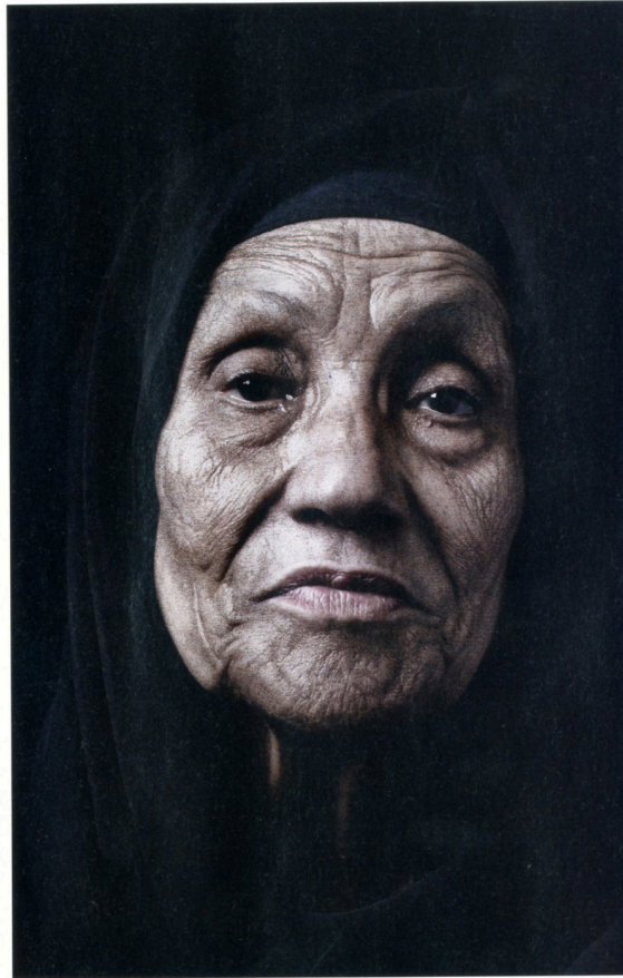
Soud , from Our House Is on Fire series, 2013, ink on digital c-print, 158 × 102 cm.