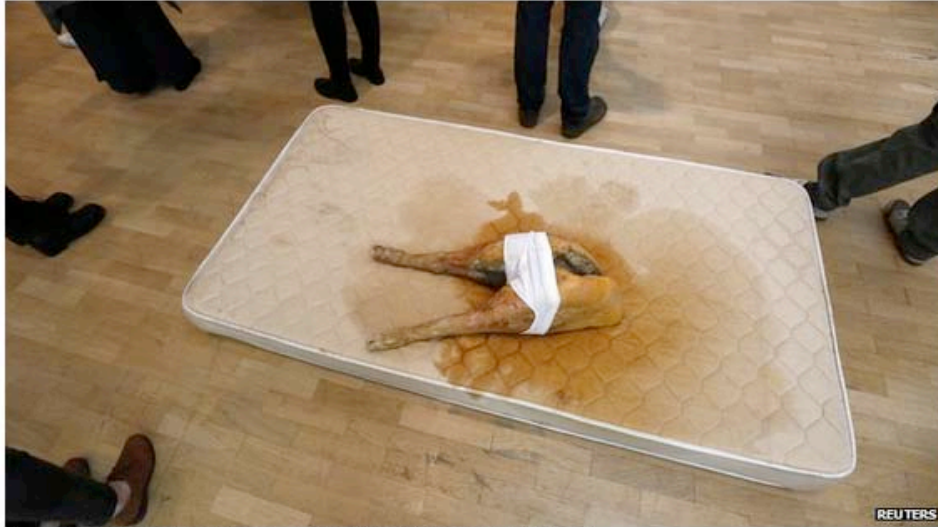
The exhibition included the work I Might Be Shy But I'm Still A Pig

"Sarah Lucas to represent UK at 2015 Venice Biennale," BBC , March 21, 2014.