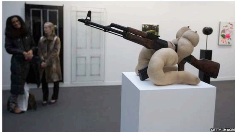
Her work Yes was exhibited at the 39th International Contemporary Art Fair Fiac in Paris in 2012