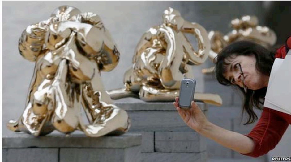
Her bronzes were included in a major exhibition at the Whitechapel Gallery in London in 2013

"Sarah Lucas to represent UK at 2015 Venice Biennale," BBC , March 21, 2014.