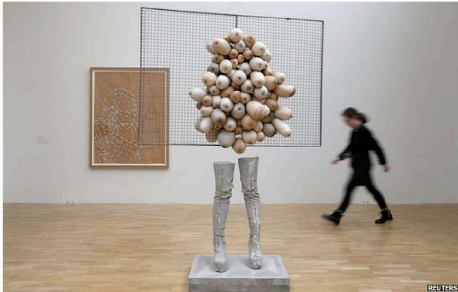
Lucas' Whitechapel show was described by The Guardian as 'strangely disturbing'