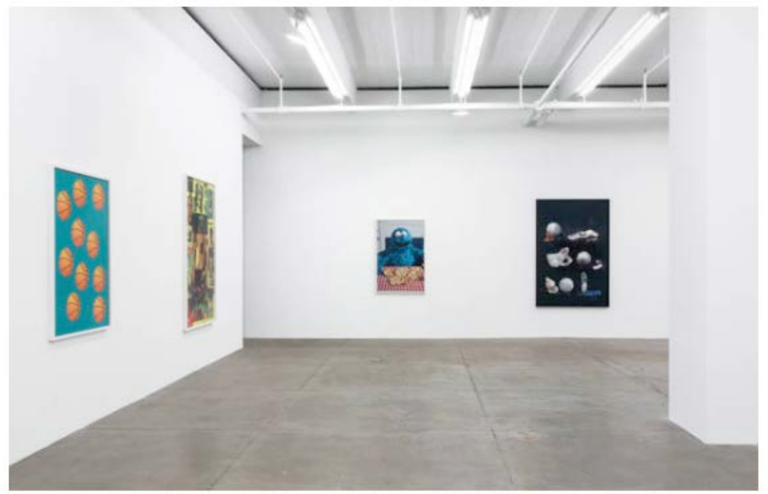
Installation view: Roe Ethridge, American Spirit. Andrew Kreps Gallery, February 23 - April 8, 2017.

Amy Ontiveros, "In Conversation: Roe Ethridge," The Brooklyn Rail, April 1, 2017