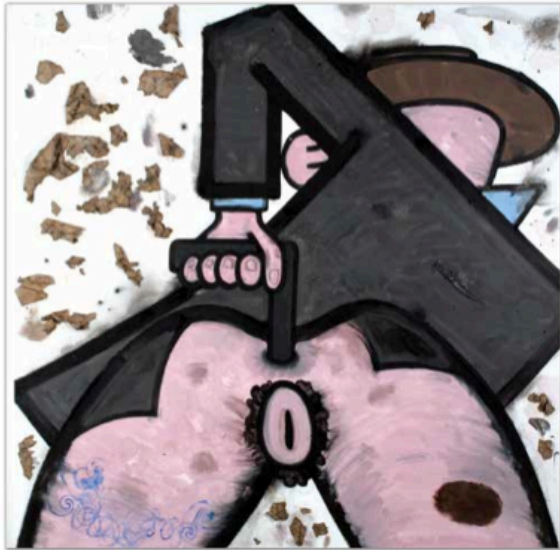
Square Mule. Mixed media on linen. 74 3/4 x 74 3/4 in. © 2006 by Carroll Dunham. Courtesy of the artist and Gladstone Gallery, New York and Brussels.

appropriate. Now I feel less sure about knowing what's good and what's bad, which is actually a huge relief.